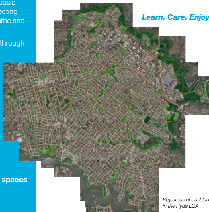
Key areas of bushland in the Ryde LGA