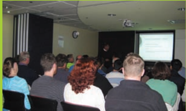
Architectural advice presented at "Making Sustainable Choices when Building or Renovating" Workshop at West Ryde Library.

See www.ryde.nsw.gov.au/sustainableliving