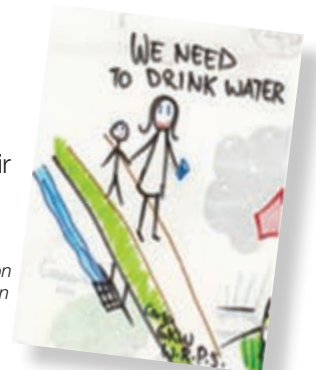
Student artworks on water conservation and stormwater protection

Several innovative interpretive signs have also been designed with input from local schools to raise residents about the concept of a water catchment, the WSUD systems and stormwater pollution. Associated bus tours, a teacher professional development session and student workshops helped educate the community about their operation and purpose.