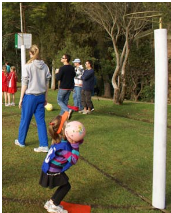
Net Set Go Program