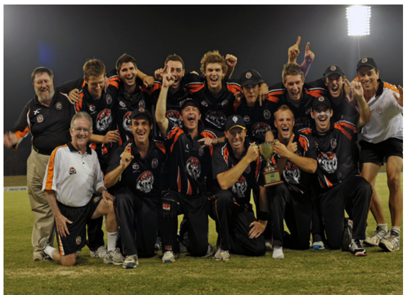
The winning T20 side from Sydney Cricket Club