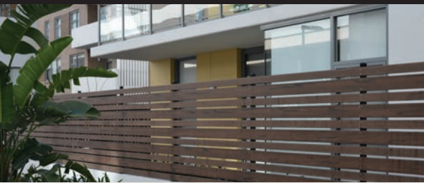
First affordable housing unit resulting from the City of Ryde Affordable Housing Policy.