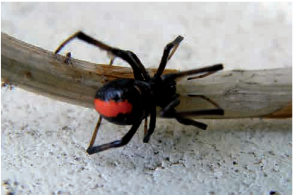
Red back spider