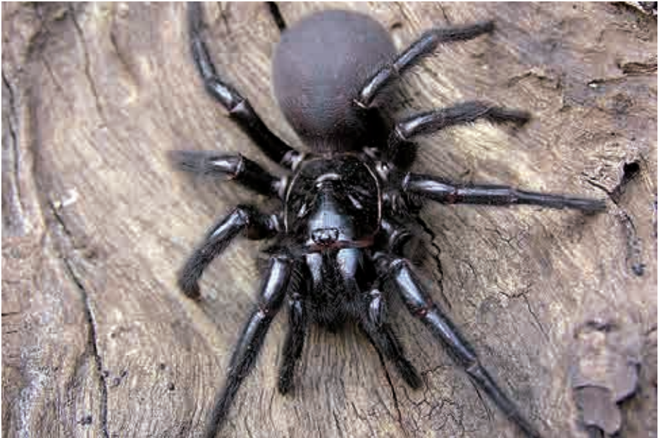
Funnel web spider