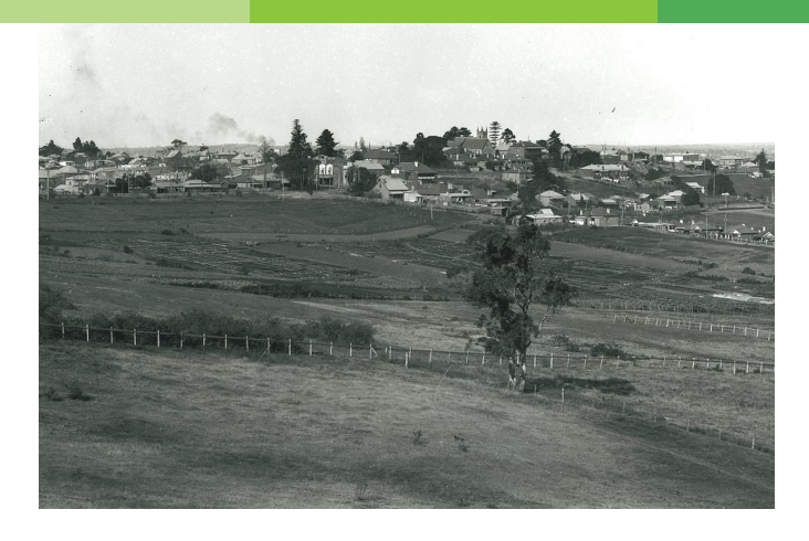
Chinese market gardens in Parkes Street, Ryde. View from Blaxland Road, near Kulgoa Ave c.1925

The first identifiable reference to men of Chinese origin in the Ryde LGA was in the Sands Directory in the late 1880s. Ah Sing in 1887-1888 and Ah Hay 1889-1890 are listed in Victoria Road, West Ryde; Ah Come from 1887-1890 in Providence Road, Ryde.