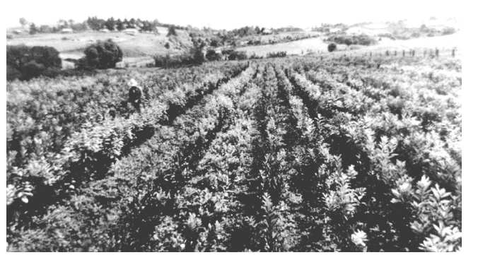
Chinese market garden in Winbourne St, West Ryde, 1920s

In addition to these there were many gardens in the Marsfield/North Ryde area along Coxs, Badajoz, Talavera, Culloden and Fontenoy Roads.