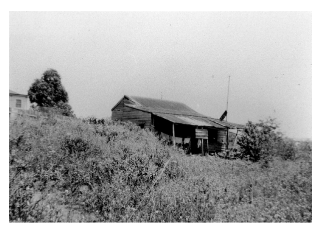
A market gardener's house in Parkes Street c.1950

Lifestyle and opportunity @ your doorstep