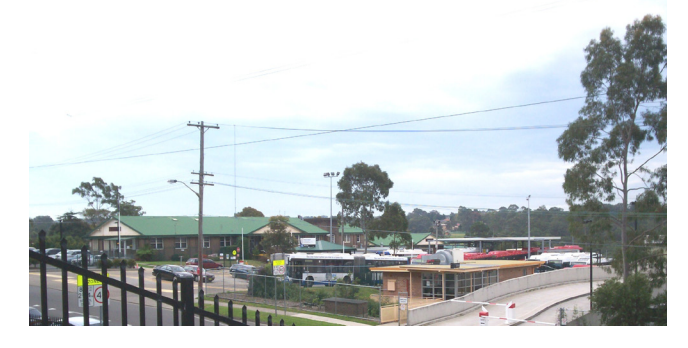
The Ryde Bus Depot, once the site of a market garden.

The names of several hundred of the Chinese men who worked in our market gardens are known from a variety of source records. If you require more information about an individual or can add to their story with personal reminiscences or photographs please contact the Local Studies Librarian.