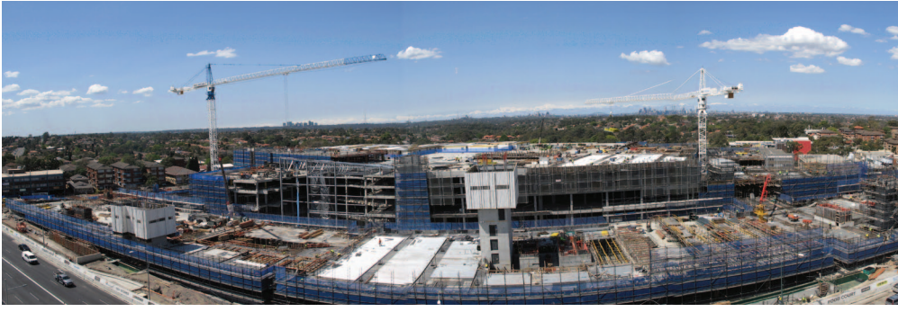
Top Ryde City shopping centre development

The Mayor's role, as Chair of Council and the civic leader of Council, is crucial to effective relationships within the administration and to good governance.