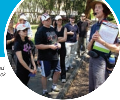
Office Workers Lunch-time Guided Nature Walk at Shrimpton's Creek

The City of Ryde also maintains around 150 hectares of dedicated recreational green spaces such as parks, ovals and gardens.