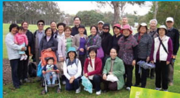
Participants of the Mandarin Speakers Interpreted Nature Walk

Engagement activities such as guided nature walks, including specialist themed walks such as a nocturnal (wildlife that is active at night), office worker's and multi-lingual walks, have been popular. As have initiatives such as a Sustainable House Day Tour of local Bushcare sites and Sustainable Home designs. The associated Future Focus Home and Garden Advisory Service has visited over 100 homes to advise on a range of sustainable living themes from rain-water tanks to drought tolerant plants.