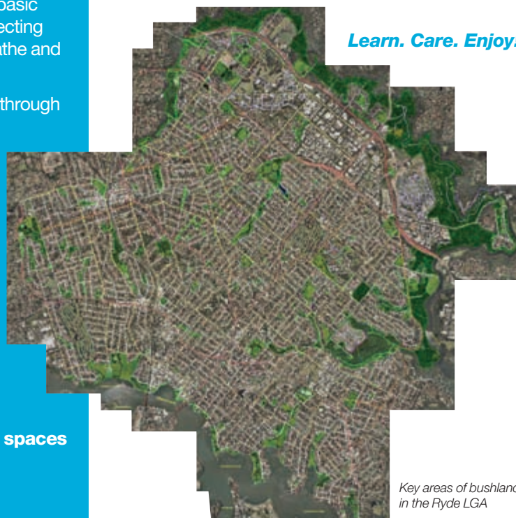
Key areas of bushland in the Ryde LGA