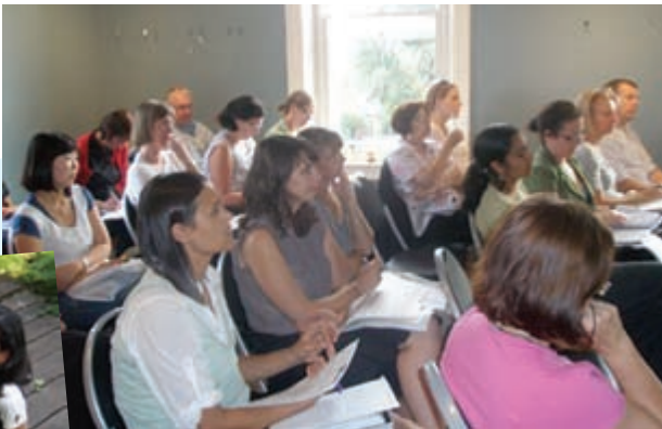
Above: Ryde Environmental Education Network Teacher's Consultation Meeting

Regular REEN meetings and expert presentations such as a recent session on School Environmental Management Plans (SEMPs) provide invaluable support to teachers and schools. A program of classroom presentations and activities for school children help educate future generations and further support with management systems is being planned.