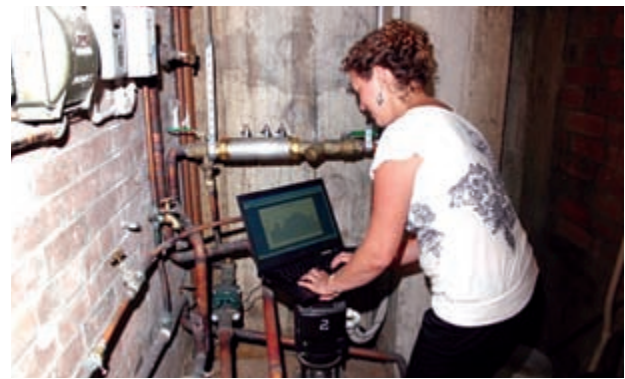
City of Ryde staff investigating water consumption at a local business

The Sustainable Businesses in Ryde Program has been developed to assist businesses reduce water and energy consumption and increase recycling, while remaining profitable and even decreasing costs.