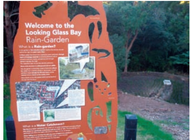
Looking Glass Bay Interpretive Signage

The multi-layered filtration systems of the rain-gardens use biological processes in soil to filter pollutants and help regulate its functions over the long-term, minimising the need for maintenance.