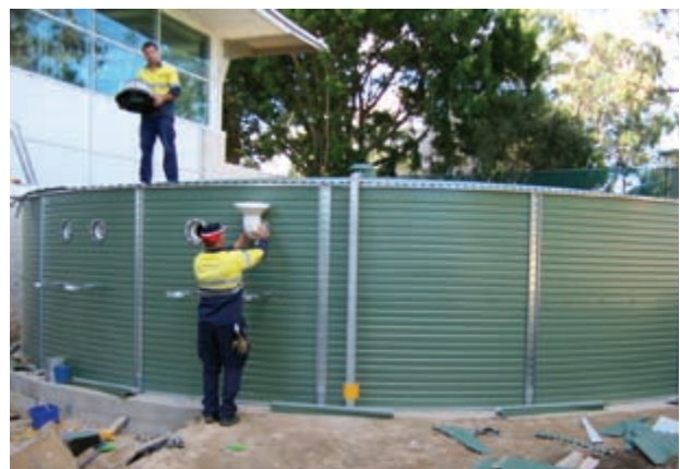
RALC Rainwater Tank Construction

The combination of the three systems within a swim centre context presents an innovative contribution to minimising environmental stresses in Local Government operations and ensuring drinking water conservation.