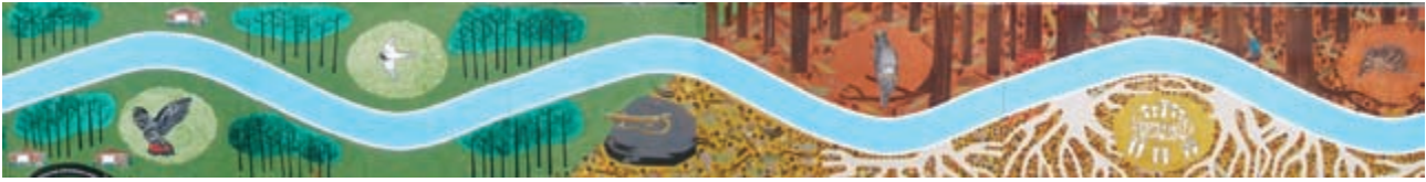
School student produced Mural Design