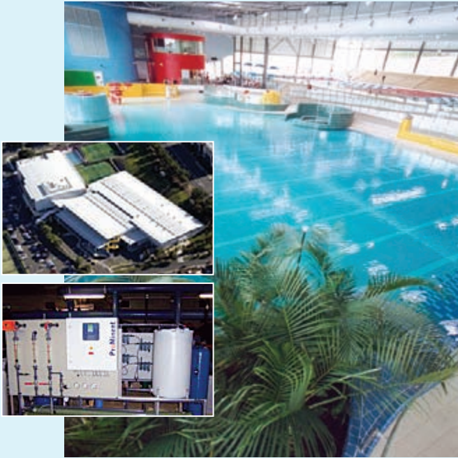
Ryde Aquatic Leisure Centre with Backwash Recovery System