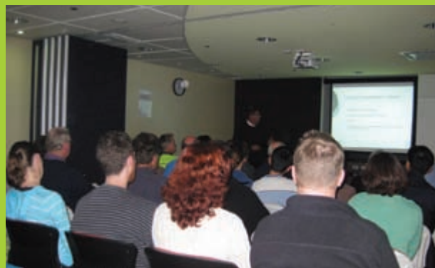
Architectural advice presented at "Making Sustainable Choices when Building or Renovating" Workshop at West Ryde Library.

See www.ryde.nsw.gov.au/sustainableliving