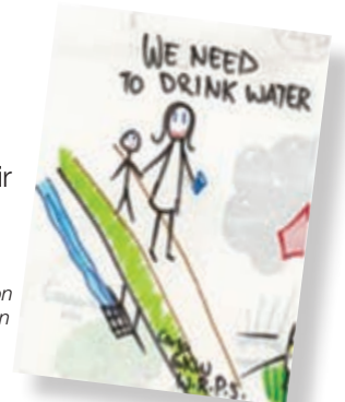
Student artworks on water conservation and stormwater protection

Several innovative interpretive signs have also been designed with input from local schools to raise residents about the concept of a water catchment, the WSUD systems and stormwater pollution. Associated bus tours, a teacher professional development session and student workshops helped educate the community about their operation and purpose.