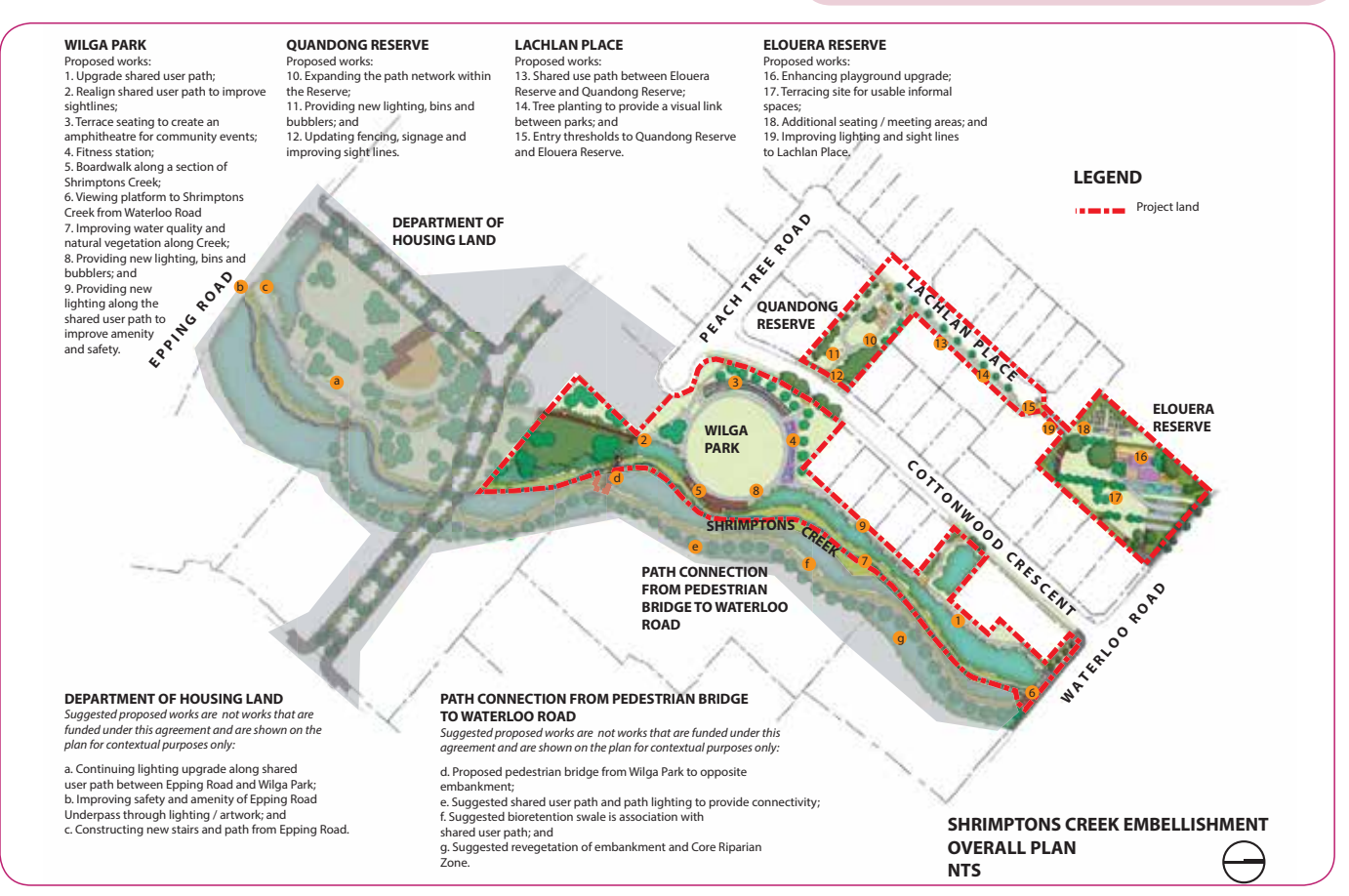
Please note: The proposed embellishment plan will be subject to more detailed consultation and design. This will commence in early 2017.

The final design, community consultation and planning phase will take place in 2017 and works are expected to be completed by the end of 2018.