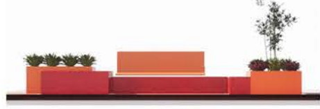
SEAT AND PLANTER OPTION 1 - ELEVATION