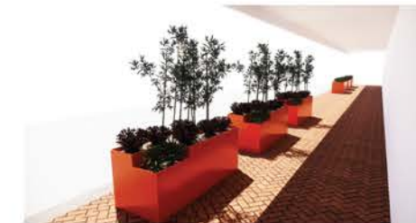
PLANTER BOX ONLY - OPTION 2