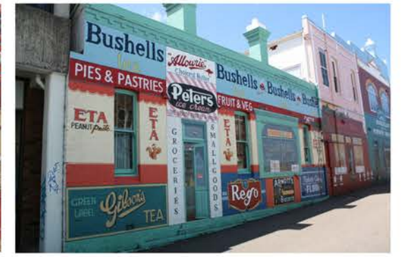
EXAMPLES OF MURALS - DURAL LANE, HORNSBY