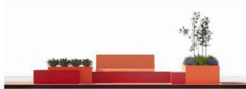
SEAT AND PLANTER OPTION 2 - ELEVATION