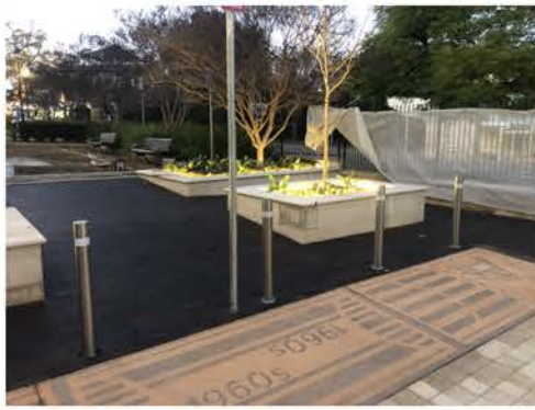
EXAMPLE OF INTERPRETATION PANEL IN GROUND PLANE - COULTER STREET, RYDE