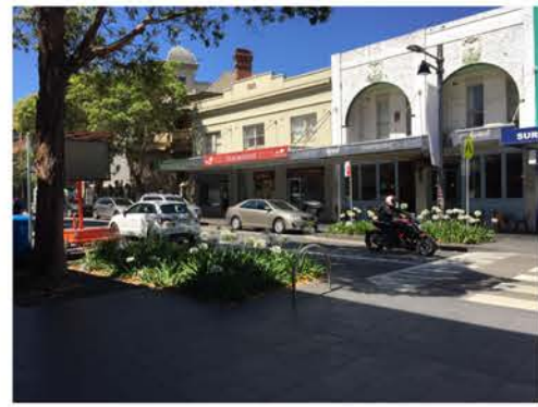
EXAMPLES OF PLANTED BLISTER KERBS AT PEDESTRIAN CROSSINGS