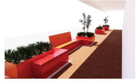
SEAT AND PLANTER OPTION 1a (POWDER COATED STAINLESS STEEL) - PERSPECTIVE