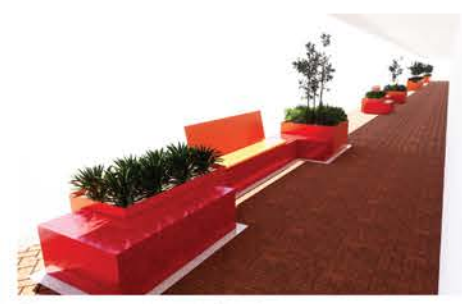
SEAT AND PLANTER OPTION 2 - PERSPECTIVE