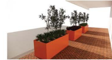
PLANTER BOX ONLY - OPTION 1