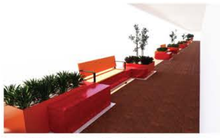
SEAT AND PLANTER OPTION 1a (TIMBER LOOK) - PERSPECTIVE