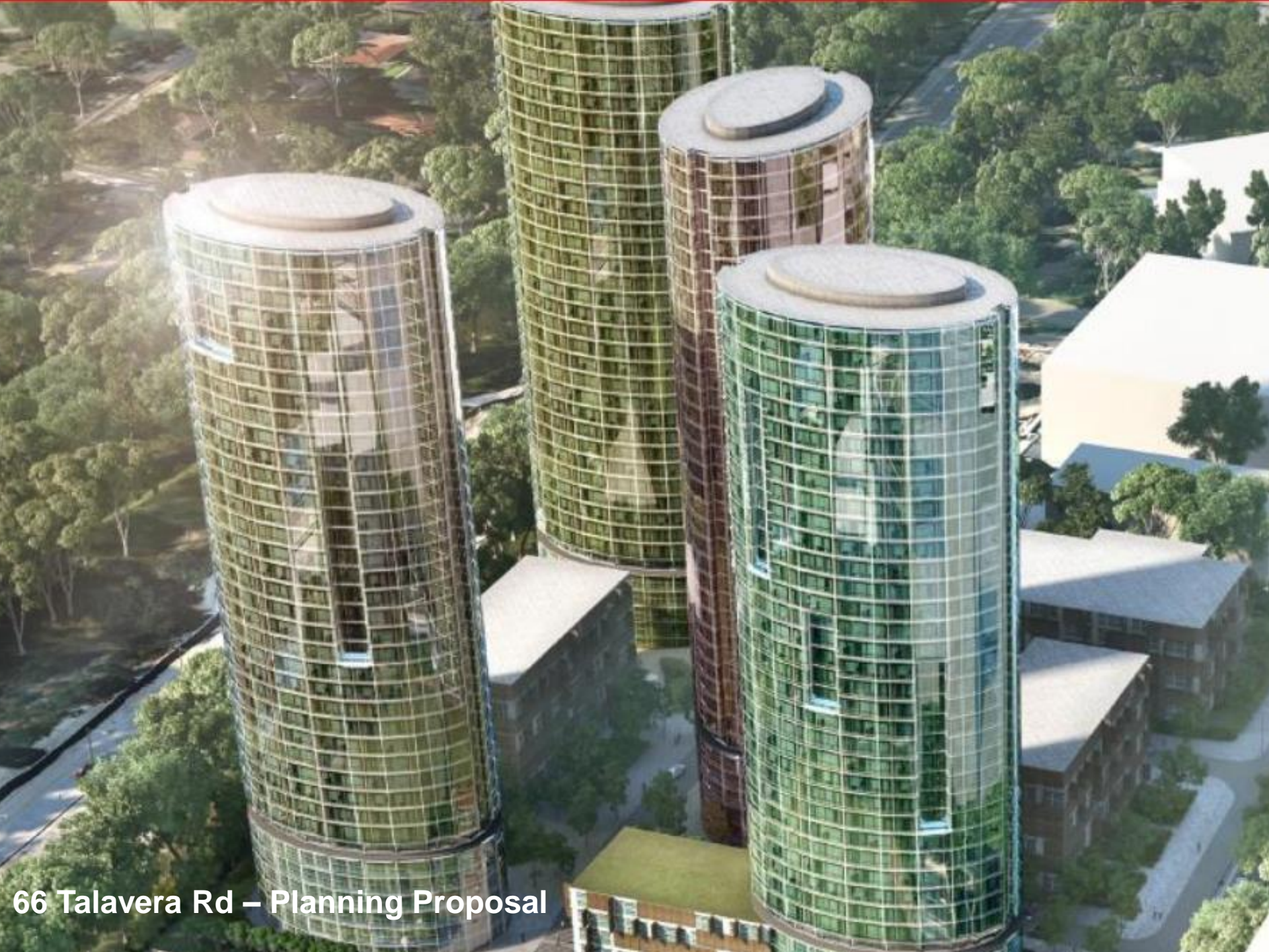
66 Talavera Rd – Planning Proposal