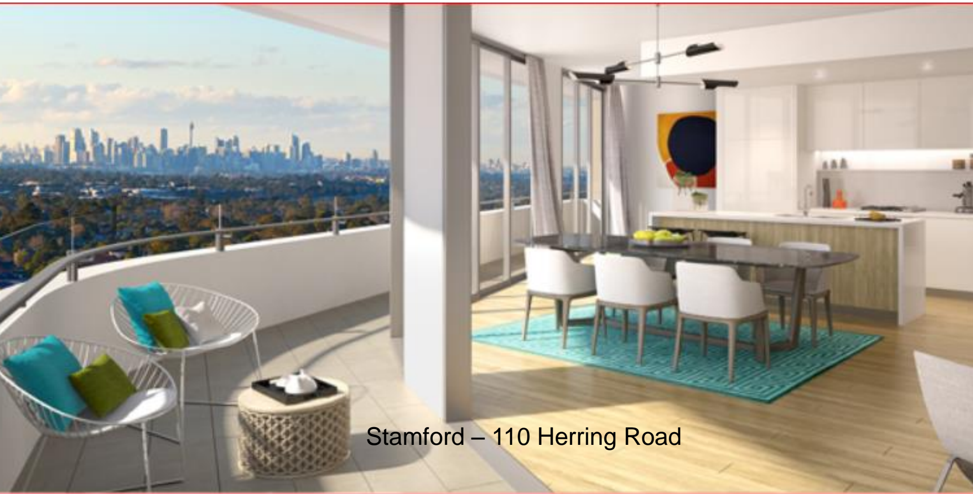
Stamford – 110 Herring Road