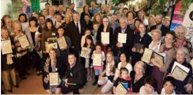
2016 Spring Garden Competition Winners