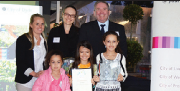
Kent Road Public School won 1st Place in the 2016 Spring Garden Competition - Best School Garden category