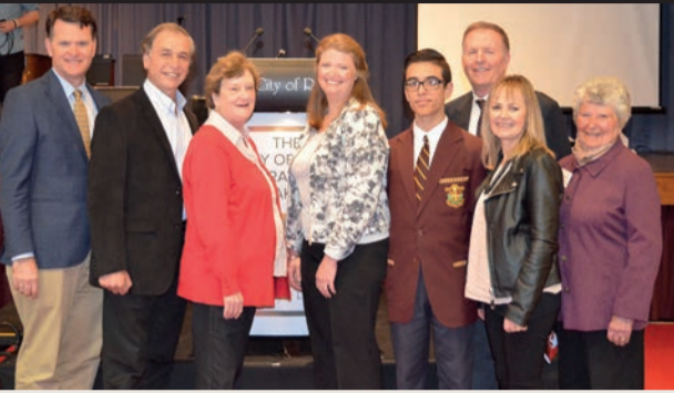
2017 City of Ryde Prayer Breakfast