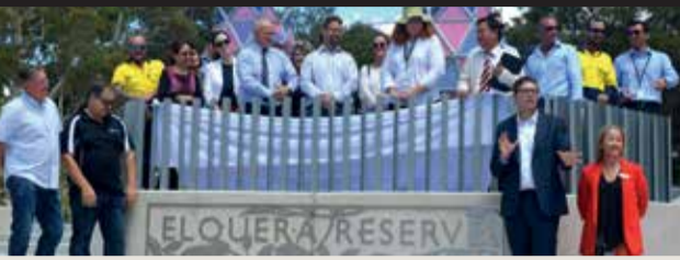
Elouera Reserve upgrade celebration