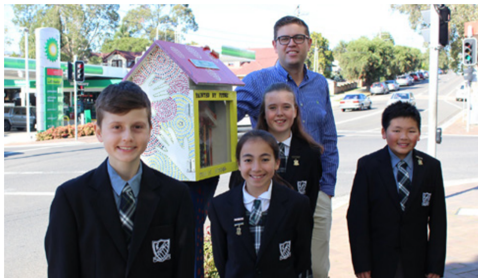
The Mayor with a street library designed by students from Putney Public School.