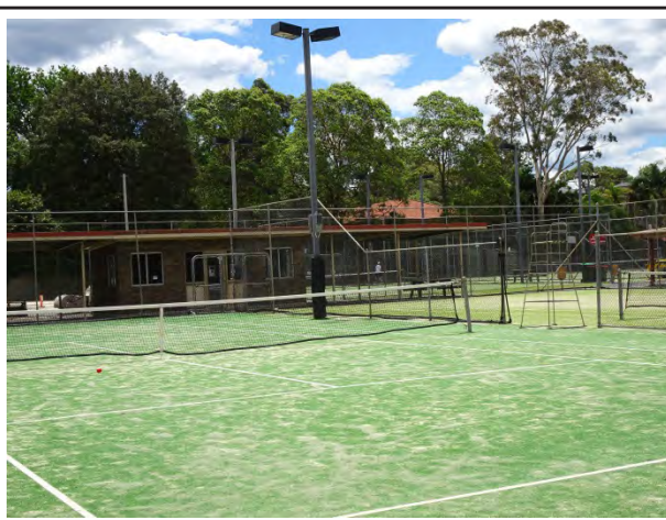
Tennis courts at Kotara Park