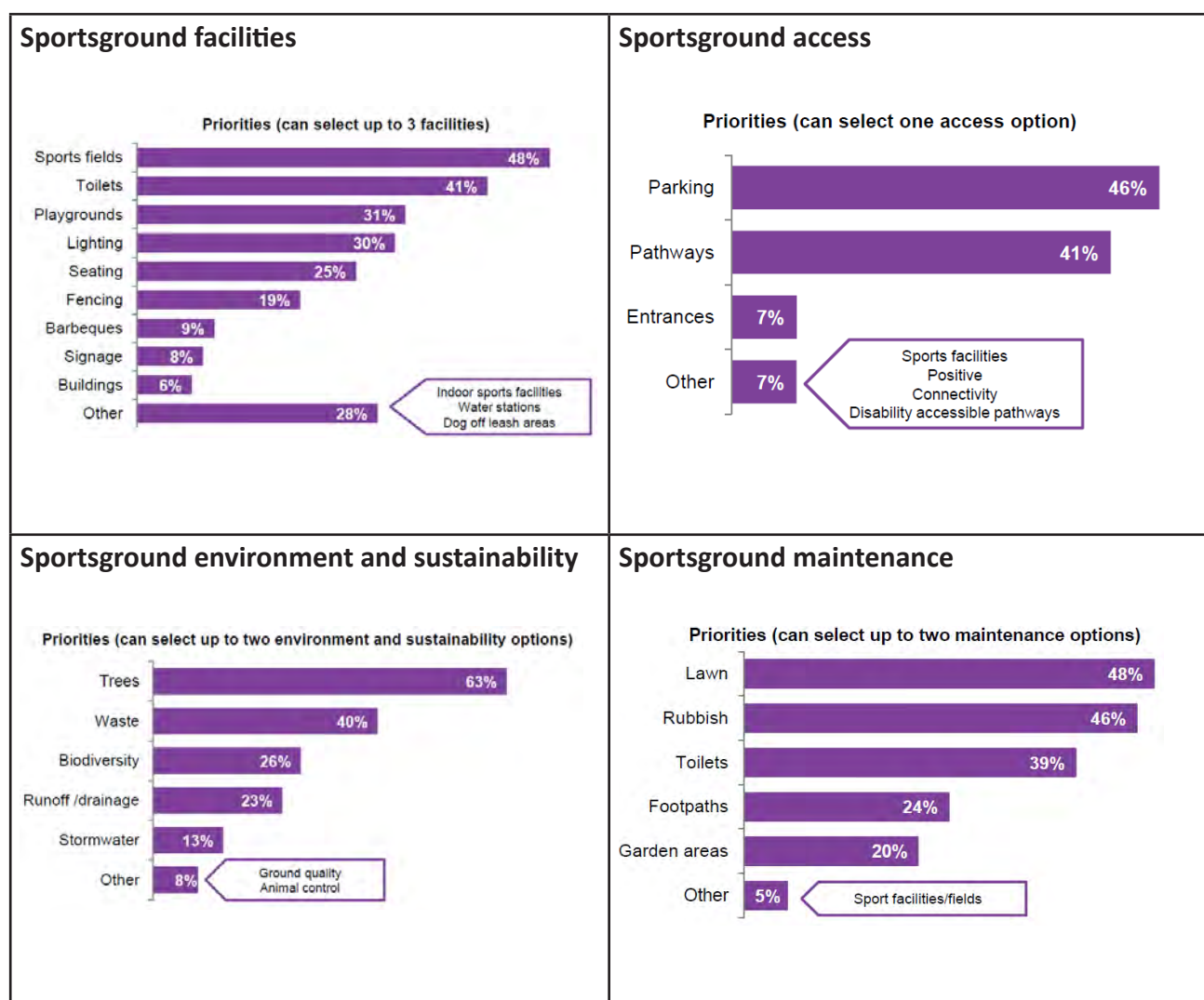
Figure 2 Priorities for sportsgrounds in City of Ryde

Priorities for sportsgrounds identified by sportsground users are shown in Figure 2.