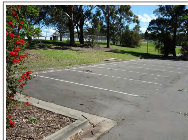
Parking spaces at Christie Park

Developments, buildings and improvements in sportsgrounds generally take the form of buildings such as amenities blocks, structures such as protective fencing, water tanks for irrigation, spectator facilities such as seating, scoreboards, carparks and landscaping.