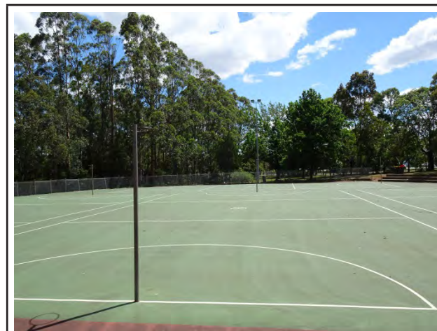
Netball courts at Brush Farm Park