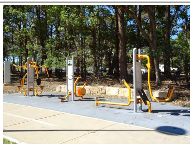
Fitness equipment at Waterloo Park