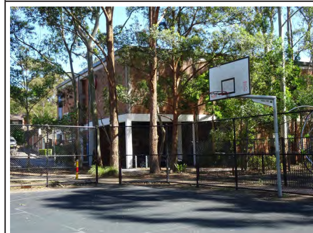
Basketball court at Waterloo Park