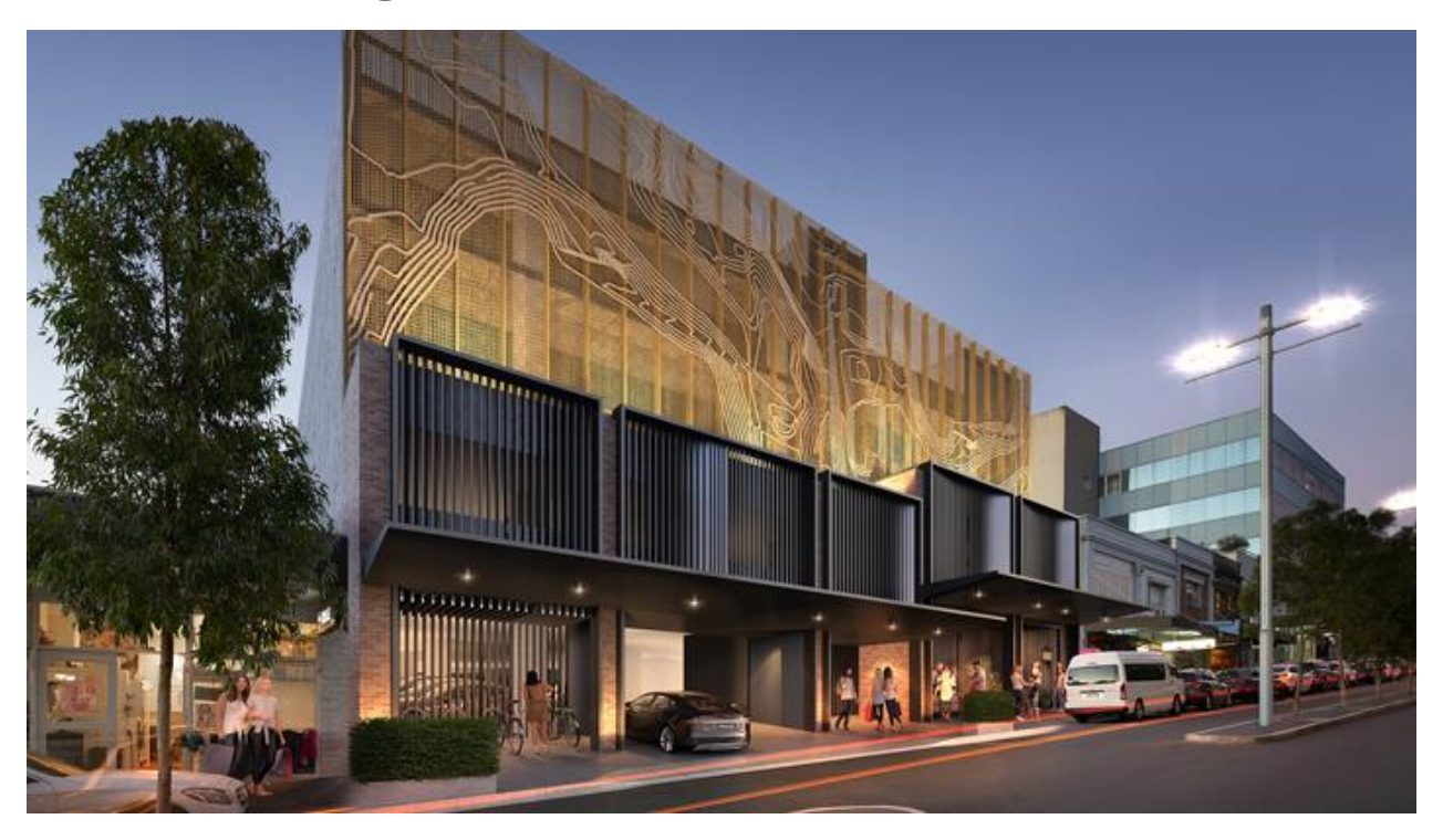
Design for 53-71 Rowe Street, Eastwood, may be subject to change

Members of the community are being encouraged to take part in the City of Ryde's consultation for the new short stay car park in Eastwood, which will address chronic parking shortages for shoppers in the area and help boost the local economy.