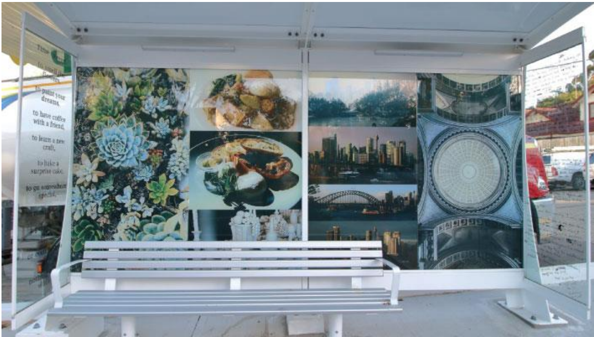
Charles Street, Putney

This program is part of a broader ideal of bringing decoration back to public infrastructure, something that has diminished greatly in Sydney since the 1930s. It is also reflective of Council's philosophy of supporting the use of buses and public transport by improving the travel experience," he said.