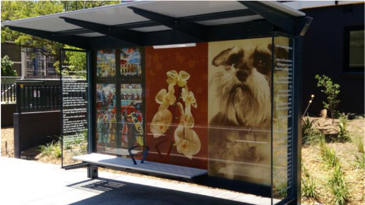
Belmore Street, Ryde

It has happened to every bus commuter. You are running to your stop fractionally late only for you to get there and see the back of the bus close its doors and drive away.