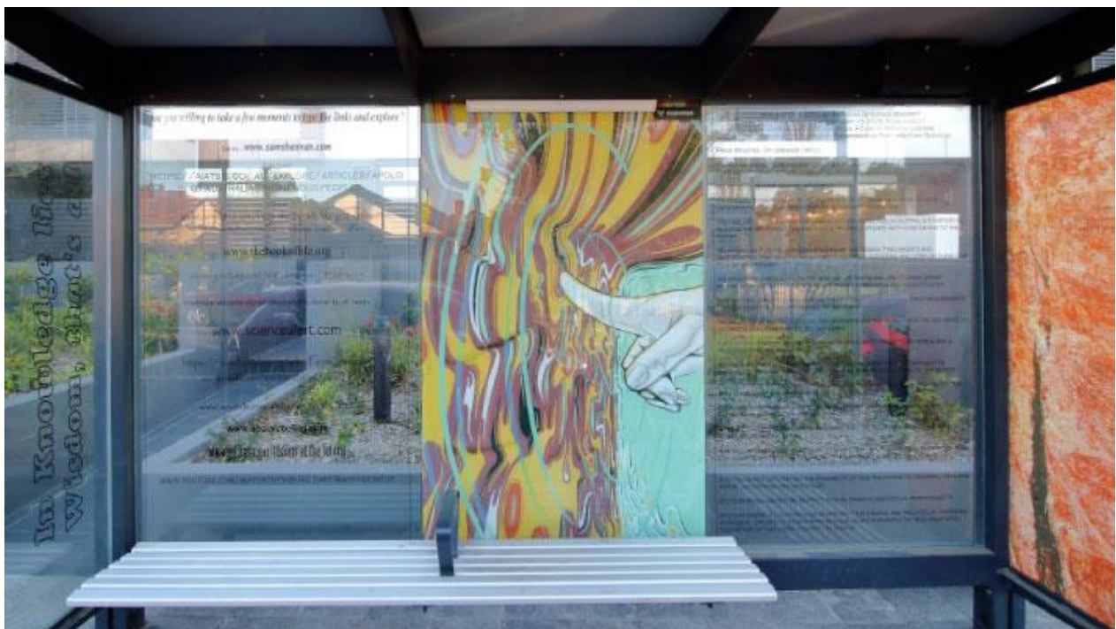
Constitution Road, Meadowbank

Under the initiative, the shelters glass covers will be decorated with creative artwork, pictures, poems, quotes as well as vegetation and other features that are accessible to feel.