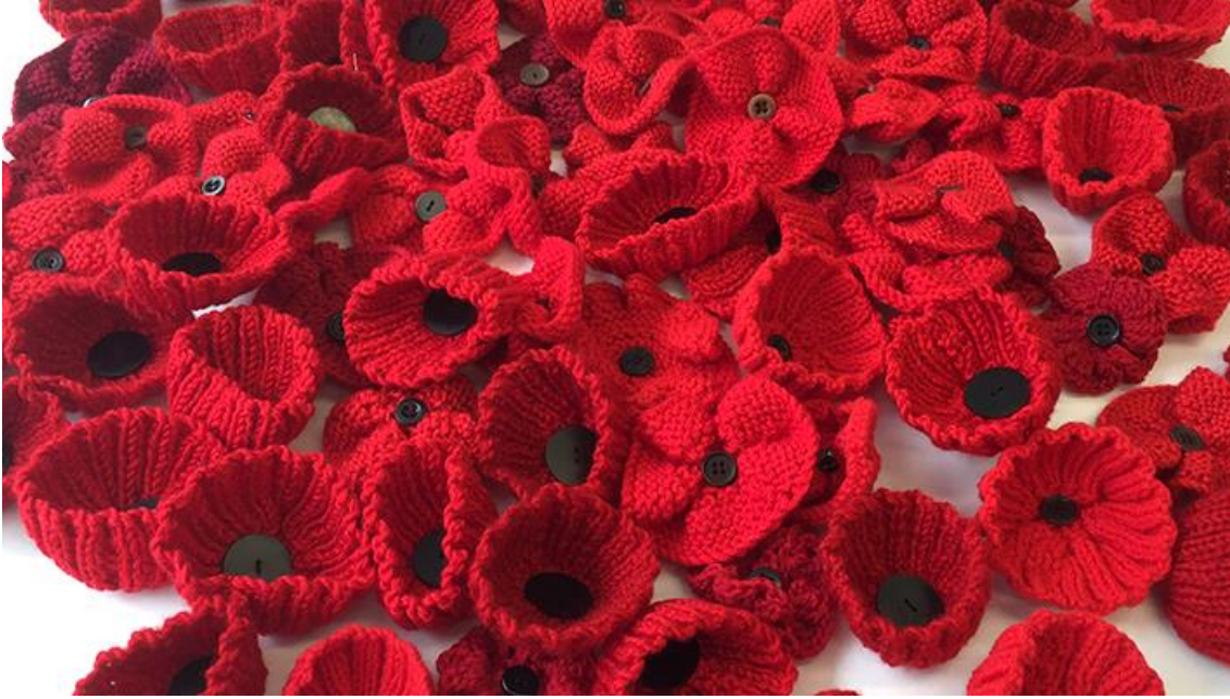
Hand-knitted poppies on display

A popular City of Ryde project that has run for three years will come to an end at the Remembrance Day Service on Sunday 11 November at Memorial Park in Meadowbank.