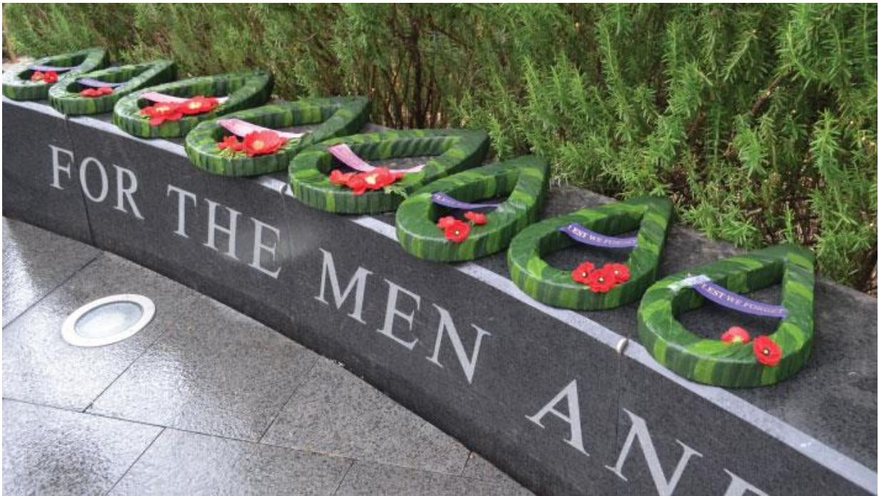
Remembrance Day at Anzac Park

On 11 November 2018 – the 100th anniversary of the Armistice when the guns fell silent on the Western Front – the City of Ryde will be distributing the last of the poppies to those in attendance at the Remembrance Day Service, heralding an end to the long-running project.