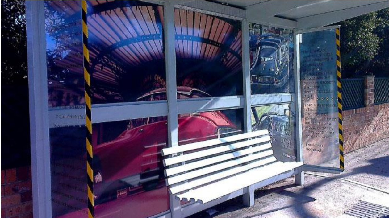
Blaxland Road, Ryde

“The themes are also intended to encourage "engagement" with being at the shelter through viewing and reading the content.”