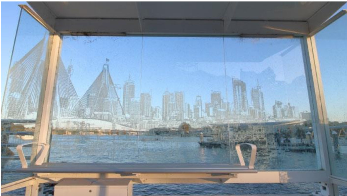
Meadowbank Wharf, Meadowbank

This program is part of a broader ideal of bringing decoration back to public infrastructure, something that has diminished greatly in Sydney since the 1930s. It is also reflective of Council's philosophy of supporting the use of buses and public transport by improving the travel experience," he said.