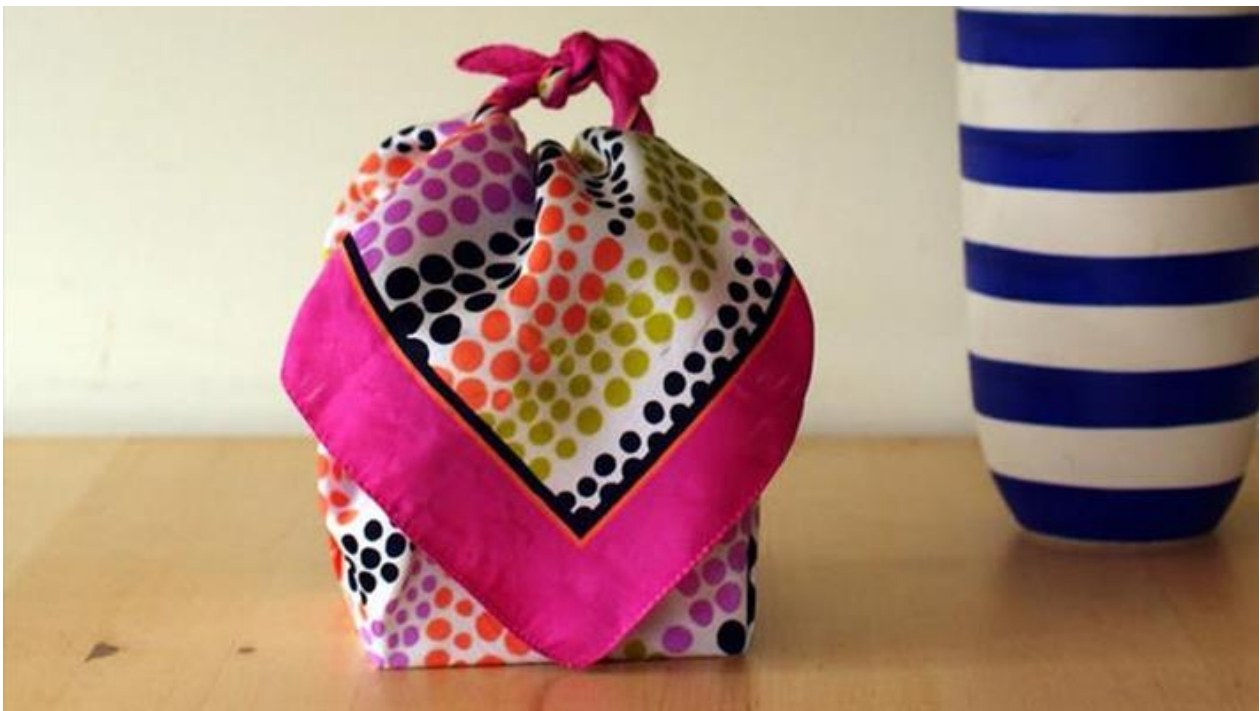
Furoshiki is the Japanese art of gift wrapping using fabric

Let's get creative! Old magazines and colourful paper are a great medium to create your own sentimental card. You can also revive last year's Christmas paper by ironing them out or use material to wrap up your presents. Scarves, tablecloths and tea towels with a nice pattern can give your present another dimension and a personal touch. We hold free Japanese fabric ('Furoshiki') wrapping classes throughout from time-to-time, or you can watch free online tutorial .