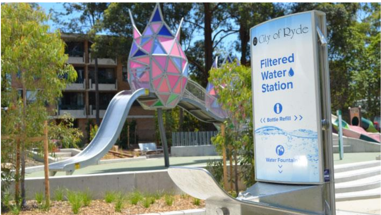
Water Station at Elouera Reserve

To find one near you, visit our Filtered Water Stations page.