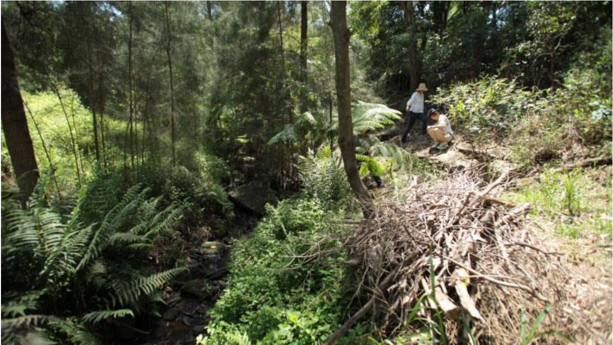
Minga Reserve, Ryde