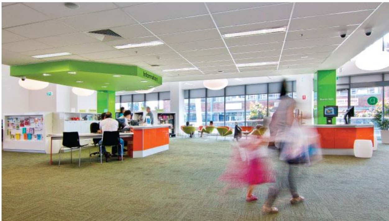
Ryde Library, 1 Pope Street, Ryde

To find out more, visit our Library page .