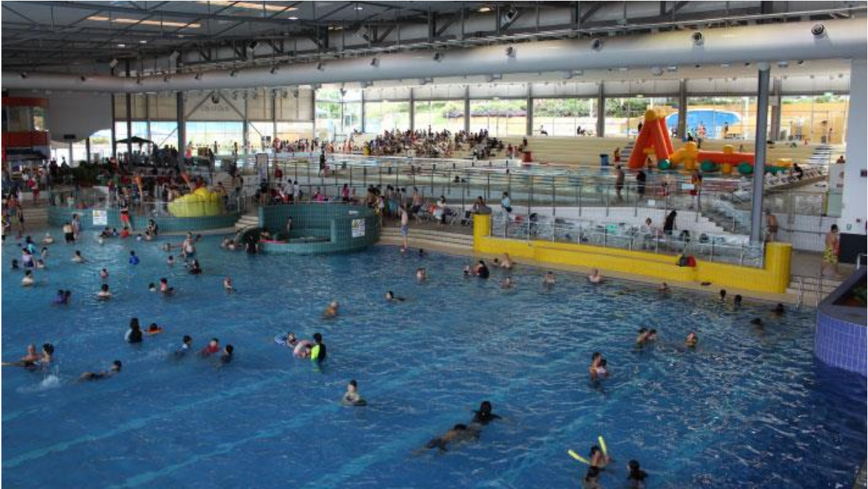
Ryde Aquatic Leisure Centre