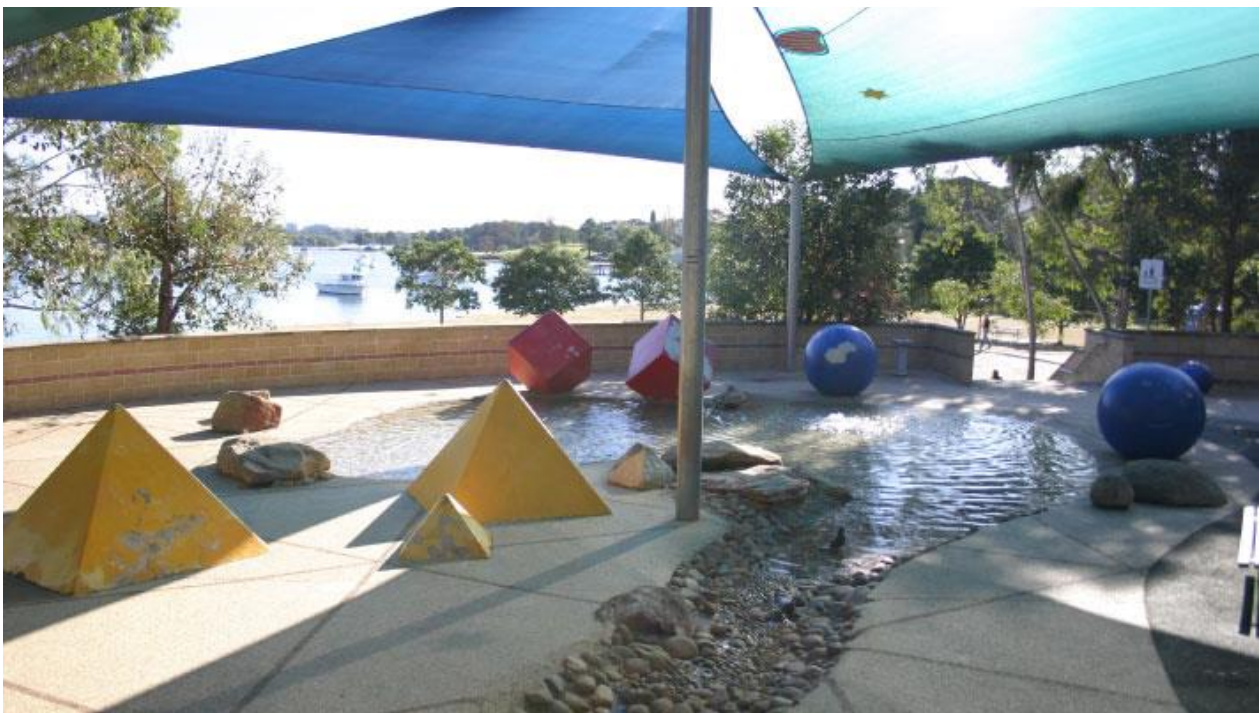
Putney Park, Putney

There are also plans in the mix to make Putney Park a swimming site by 2025 as part of the Parramatta River Masterplan. Find out more .