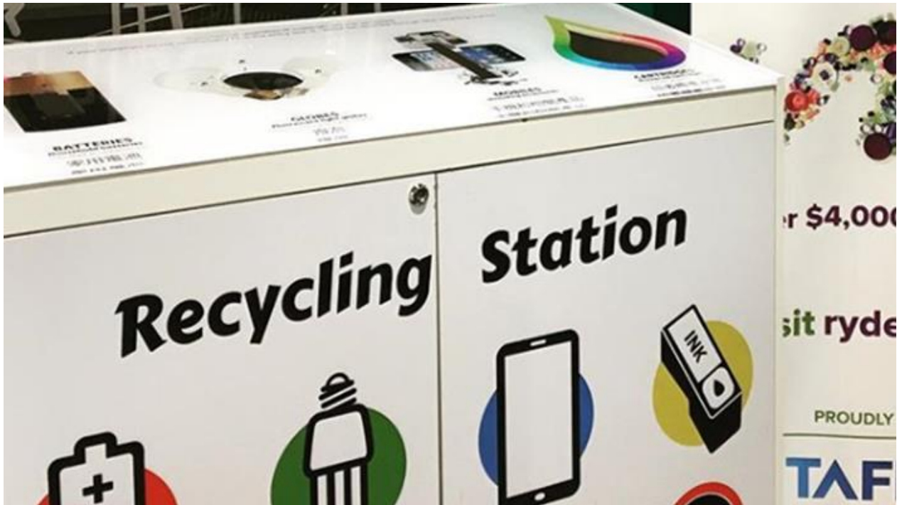
Council problem waste recycling station

Let's Recycle Right! About 75 per cent of waste at households is recyclable.