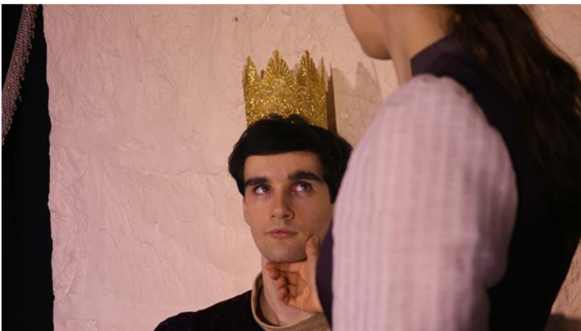
Ryde Youth Theatre in action