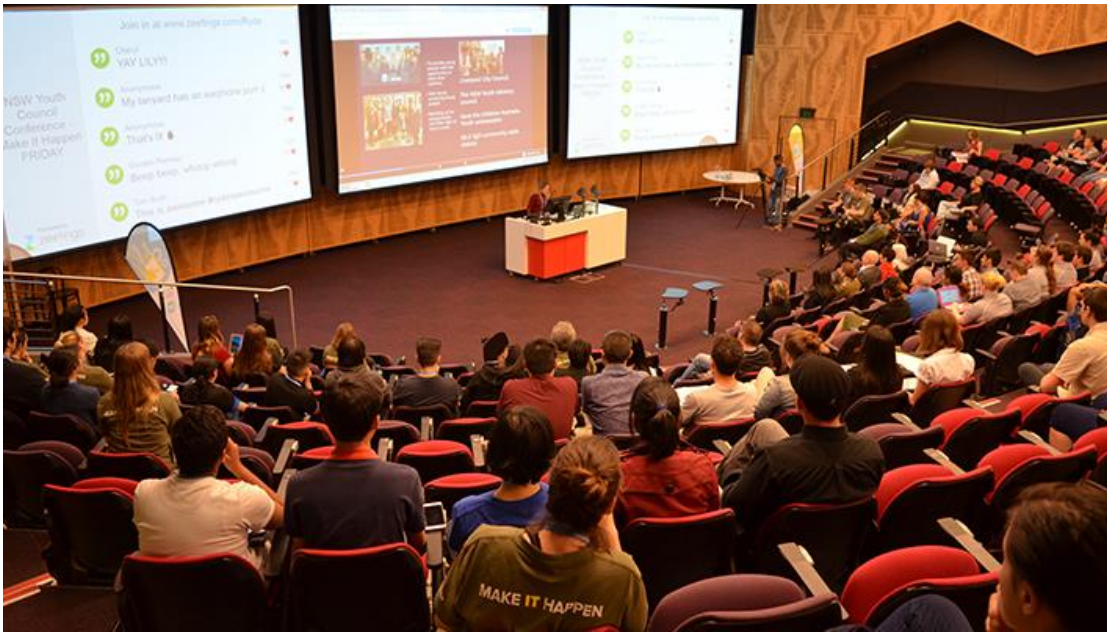
NSW Youth Council Conference

The Ryde Youth Council represents an important youth voice in Council decision-making. Comprised of young people who live, study, work or play in the City of Ryde, in addition to a representation from Council, its members carry out a range of activities including: