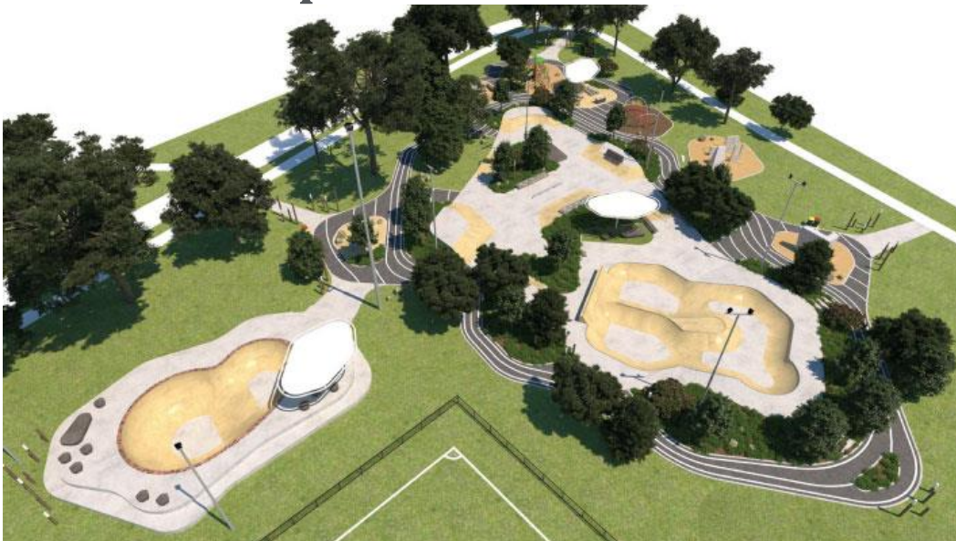
Concept plan for the Meadowbank Park Outdoor Youth and Family Recreation Space