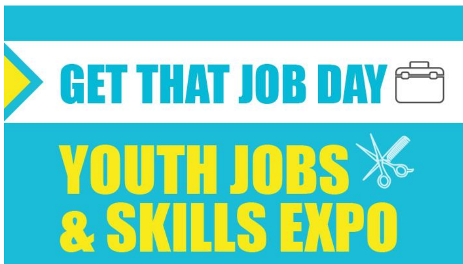
2019 Youth Jobs & Skills Expo