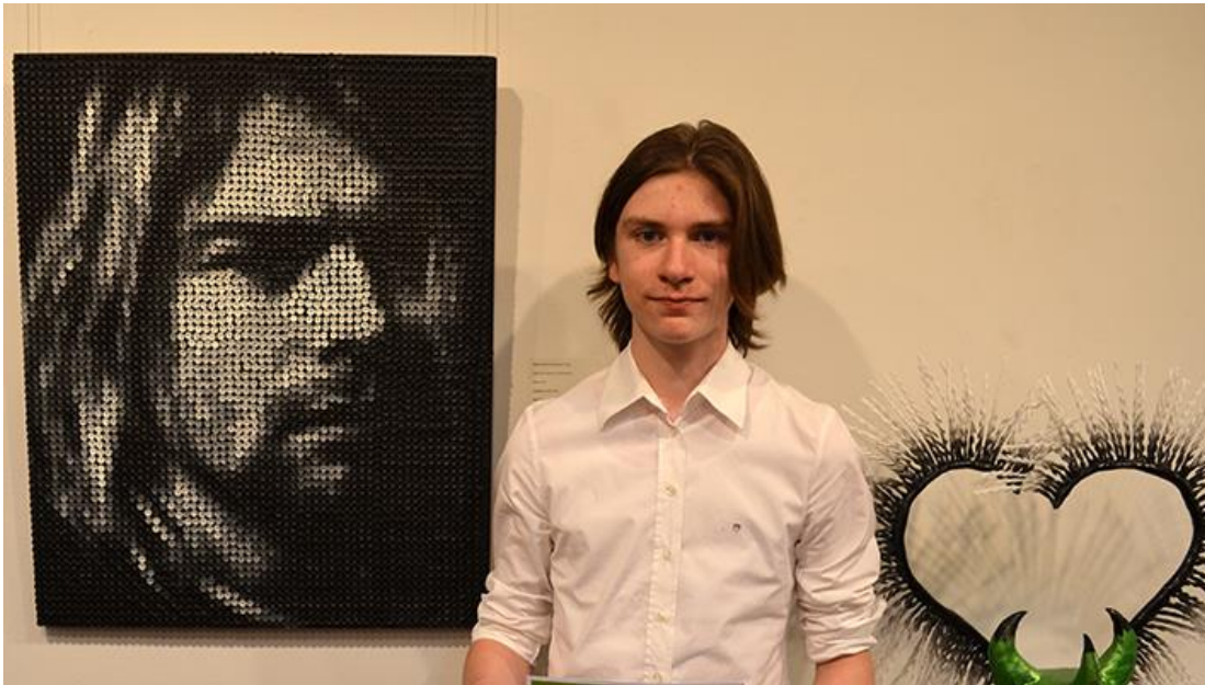
2018 Sustainable Waste 2 Art Junior Youth Environment Prize 1st Place winner

Each year, sustainability and art meet with the City of Ryde's Sustainable Waste to Art Prize (SWAP).