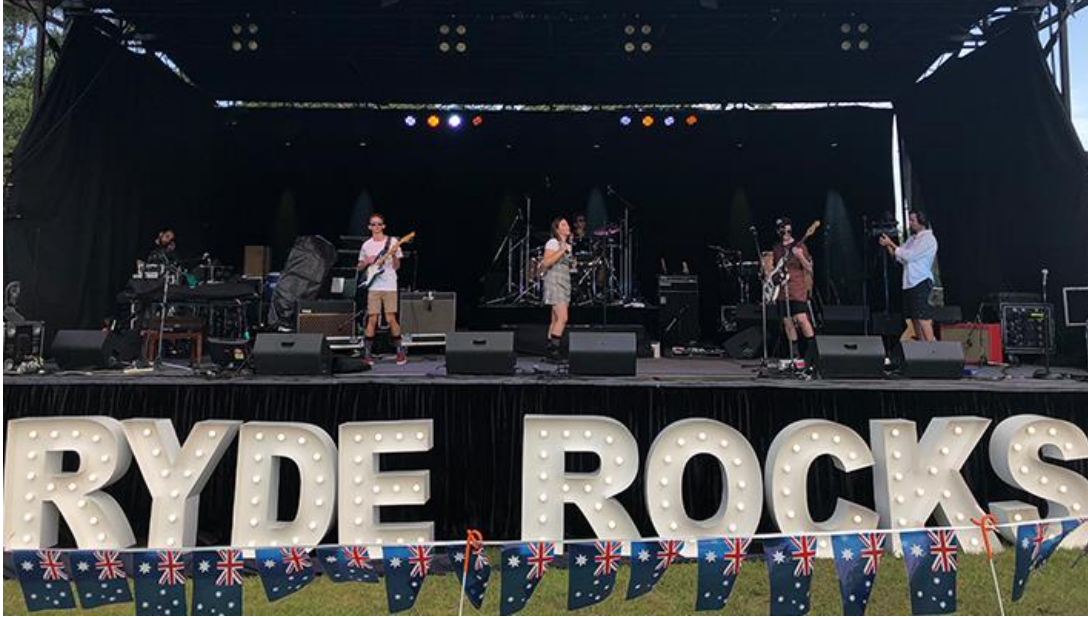
2019 Battle of the Bands winner, Saturn V

This crowd favourite is the perfect launching pad for young musicians. Ryde Battle of the Bands is open to all young bands (with members aged between 12 and 25 years). Entry is free and the top 3 shortlisted bands perform at the City of Ryde Australia Day concert. Prizes include $1,000 in cash and a mastering session with Studios 301.