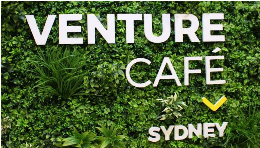
Venture Café, Macquarie Park