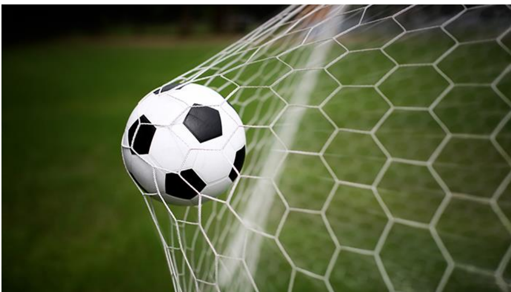
Check out our first-class sporting facilities

Each of these playing fields offer consistent playing surfaces 365 days of the year, even during the coldest and wettest periods. So grab some friends and check out these first-class facilities this winter.