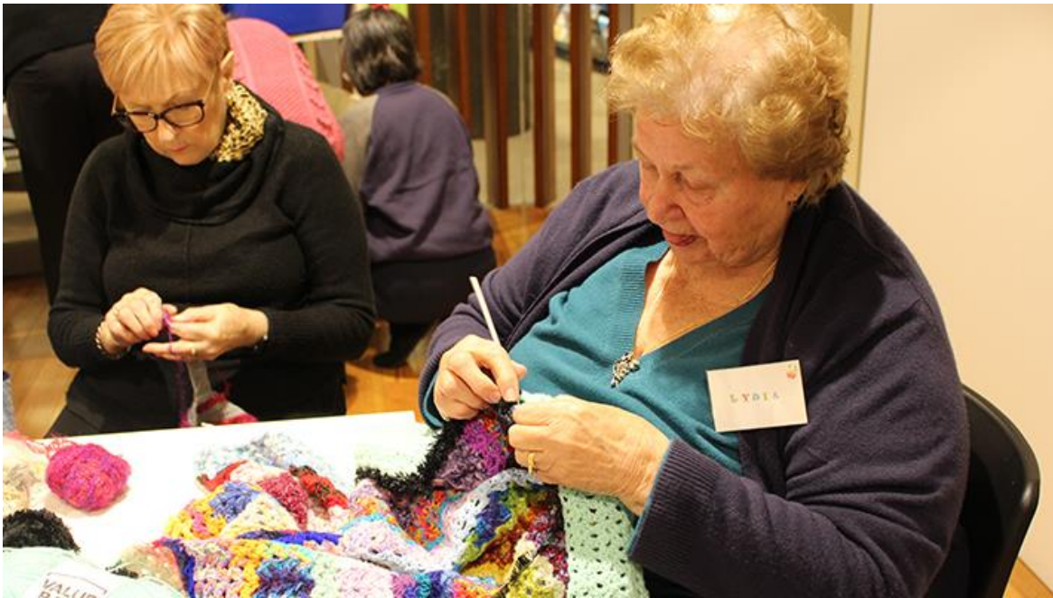
West Ryde Knitting Group members hard at work

Others talked about how therapeutic they find the process of knitting, as like any creative process it provides a wonderful escape from ordinary life. "You can pick up your needles anywhere and do some knitting while you're in the car or sitting in front of the television", one member said.