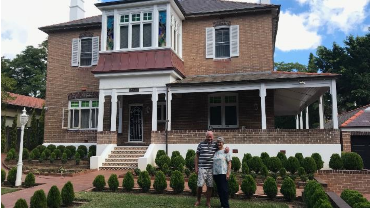
'Ripley', a beautiful example of a Federation Arts & Crafts style home in Eastwood

The City of Ryde has endorsed a raft of reforms that will offer stronger protections for places of heritage significance while also providing more funding to homeowners to help conserve and add value to their heritage-listed properties.