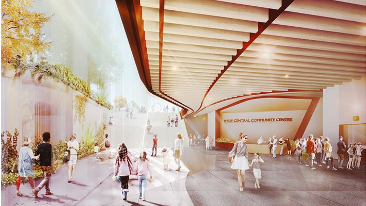
Concept image of community centre

The City of Ryde has released a new indicative image detailing how the interior of the New Heart of Ryde community facility could look.