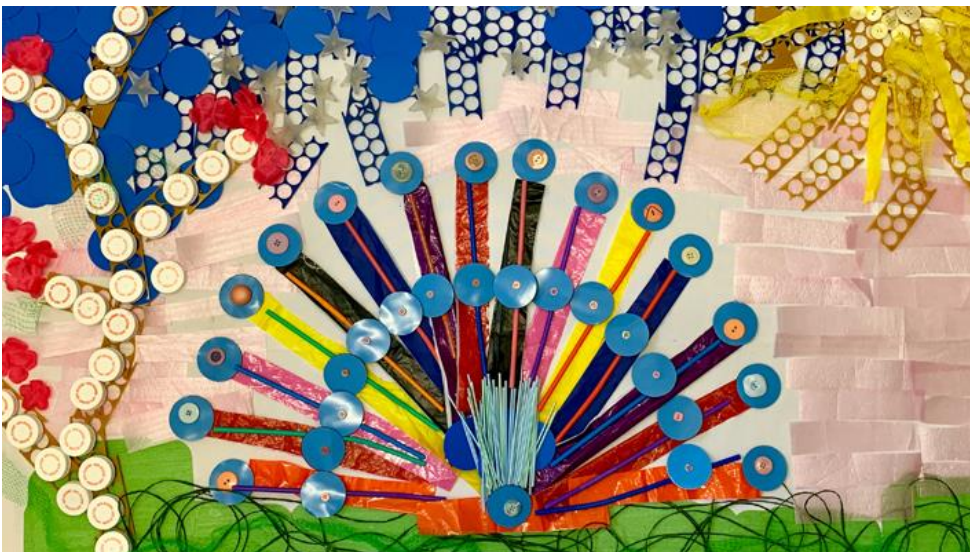
Sustainable Waste to Art Prize

To submit your entry or find our more, visit the Sustainable Waste to Art Prize page .