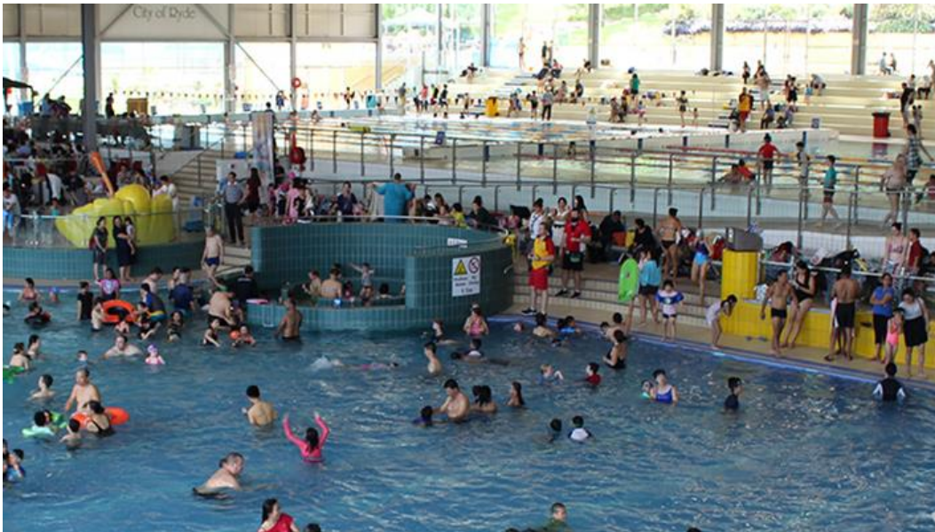
Ryde Aquatic Leisure Centre

This pass gives all recipients access to the RALC's giant water inflatable course, 40-metre wave pool, junior and giant water slides and much more. Even better, all the pools at RALC are heated. For more information, visit the Ryde Aquatic Leisure Centre page .