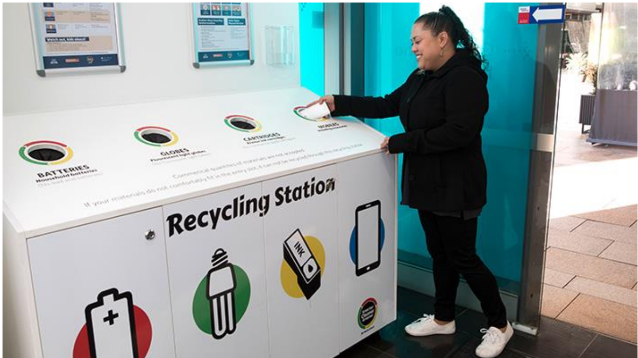
New problem waste drop-off station

Ryde Aquatic Leisure Centre (RALC) is now home to a brand new Problem Waste Drop-Off Station!