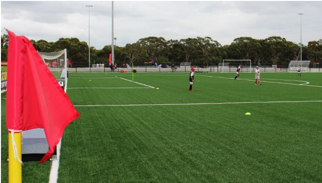
First-class sporting facilities at Christie Park

The weather is cool, the days are short and while many people prefer to stay indoors during the winter months there are still plenty of great activities going on in the City of Ryde during this time of the year for the whole community to enjoy.