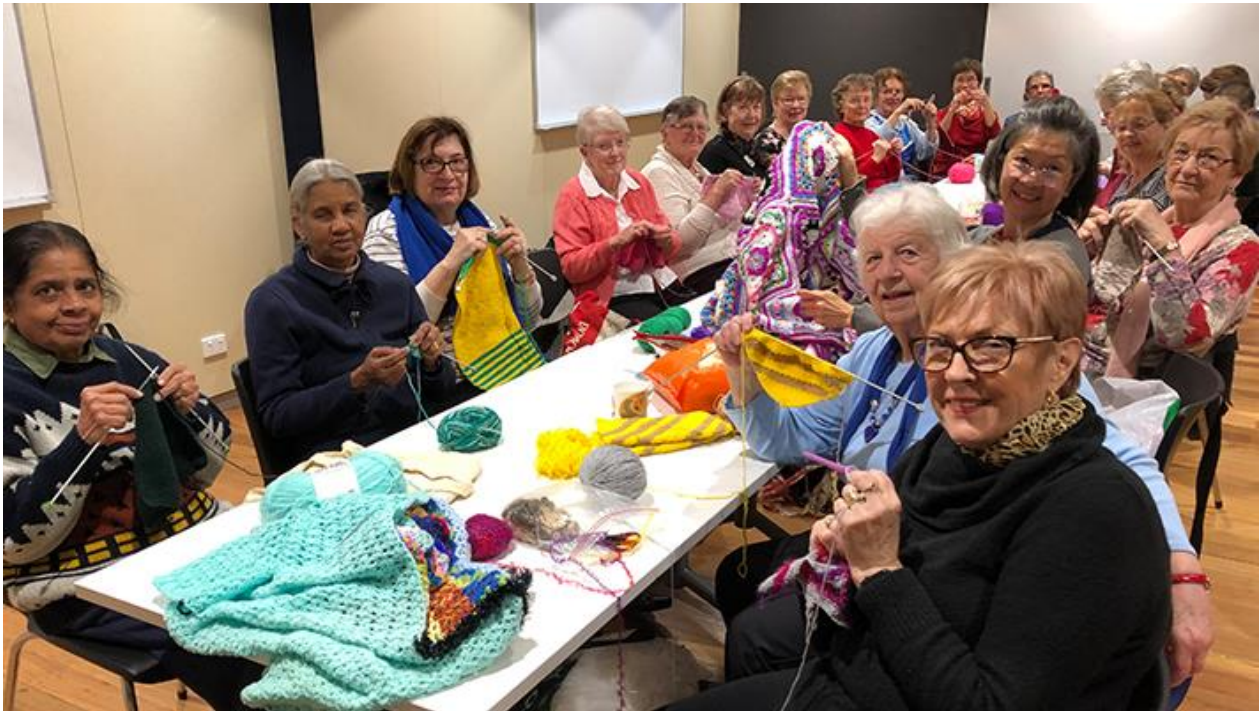
West Ryde Knitting Group

Celebrating its tenth year running, the West Ryde Knitting Group has been feverishly knitting in the lead up to the City of Ryde's annual Knit In on Friday 2 August. Each year, the event brings together knitters from across the City, including those both in established groups and aspiring knitters, who all make and donate hundreds of lovingly crafted handmade blankets to Wrap with Love . This not-for-profit organisation sends wraps to people in more than 75 countries, including within Australia, with volunteers making, transporting and assembling the blankets.