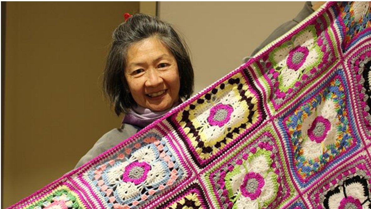
Holding up a masterpiece

"The best thing is that you feel like you've accomplished something at the end".