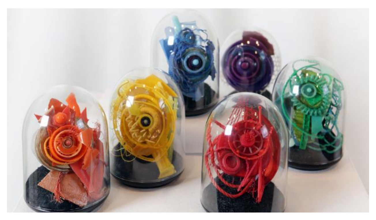
'Diatoms' by Tracie Axton, which won the SWAP open category

An artwork which uses discarded plastics to highlight the damage pollution can create in our waterways has taken out the major award at the City of Ryde 2021 Sustainable Waste 2 Art Prize (SWAP).