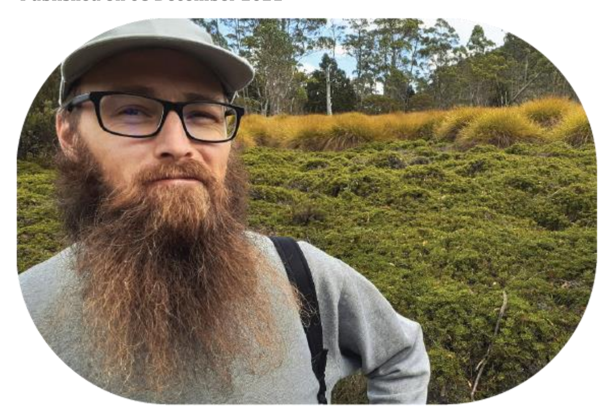
Tell us a bit about who you are and what kind of creative work you make.

I am a freelance animator and motion designer currently working on advertisements and corporate videos. I have previously worked on animated children's tv shows and a short film.