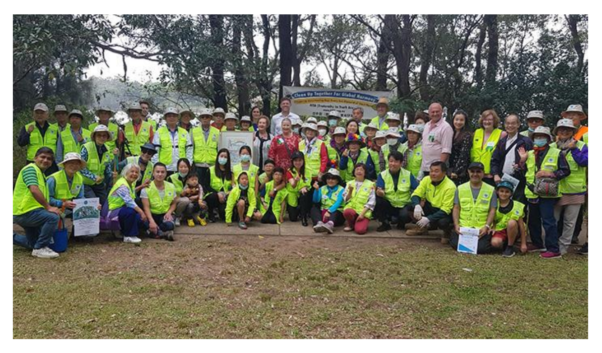
Clean Up The World 2021

Council has recognised the hard work of the Fraternity In Truth Association (FITA) group in cleaning up our foreshore with the installation of a plaque at Kissing Point Park in Putney to honour their volunteering efforts over the past 20 years.