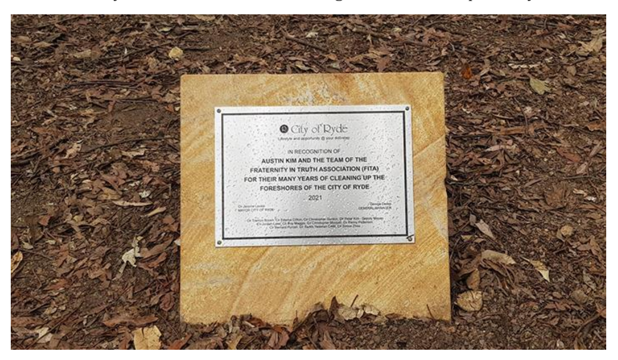
The plaque at Kissing Point Park

Council has recognised the hard work of the Fraternity In Truth Association (FITA) group in cleaning up our foreshore with the installation of a plaque at Kissing Point Park in Putney to honour their volunteering efforts over the past 20 years.