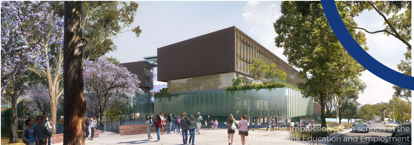
Artist impression of the schools at the Meadowbank Education and Employment Precinct