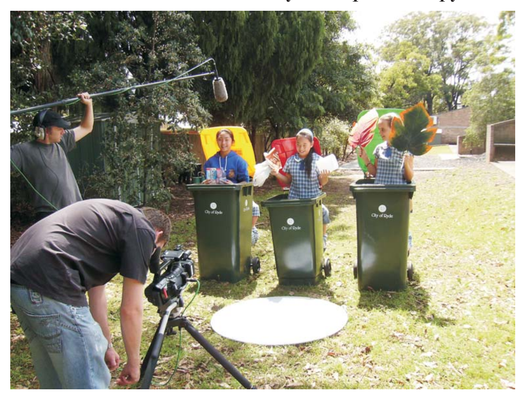
Above. Filming the Waste section of the DVD at Ermington Public School

Please contact Council if you require a copy