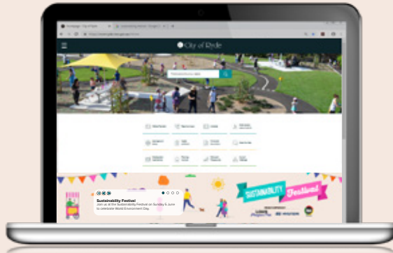
City of Ryde website – Rolling banner