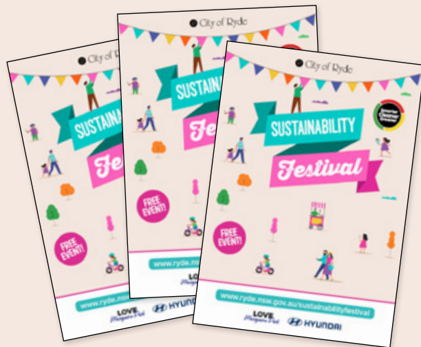
Flyer – Logo inclusion

(2x Stories each on Facebook and Instagram)