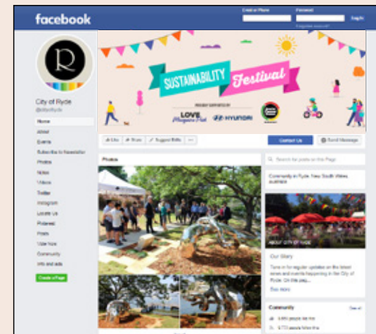
City of Ryde Facebook page

www.ryde.nsw.gov.au/sustainabilityfestival