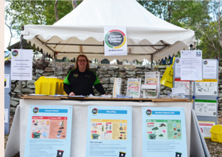
3x3m fete stall at the festival to further promote your brand