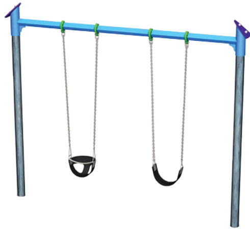
A SWINGS WITH TODDLER SEAT

FIBRE MESH RAMP TO PLAY PANEL AND BINOCULARS