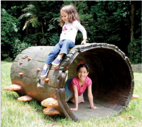
C HOLLOW LOG CLIMBER AND TUNNEL