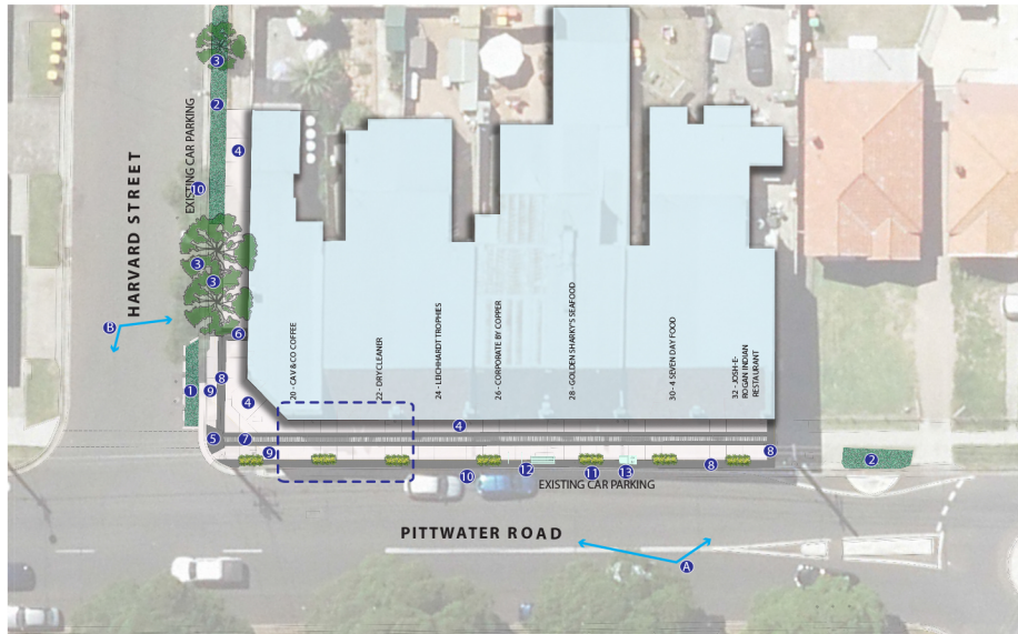
PITTPATER ROAD NEIGHBOURHOOD CENTRE RENEWAL - CONCEPT PLAN (FOR CONSULTATION ONLY)