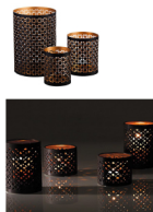
PLANTER - INDICATIVE ONLY (NOT SHOWN TO SCALE)