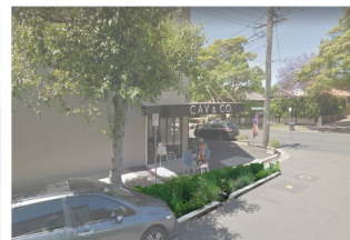
AFTER - HARVARD ST RAIN GARDEN PERSPECTIVE (VIEW B)

NEIGHBOURHOOD CENTRE RENEWAL CONCEPT PLAN