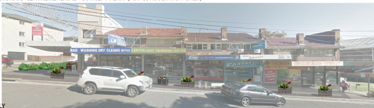
AFTER - PITTPATER ROAD ELEVATION PERSPECTIVE (VIEW A)