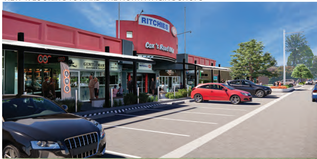
VIEW 1: LOOKING TOWARD THE NORTH FACING SHOPS