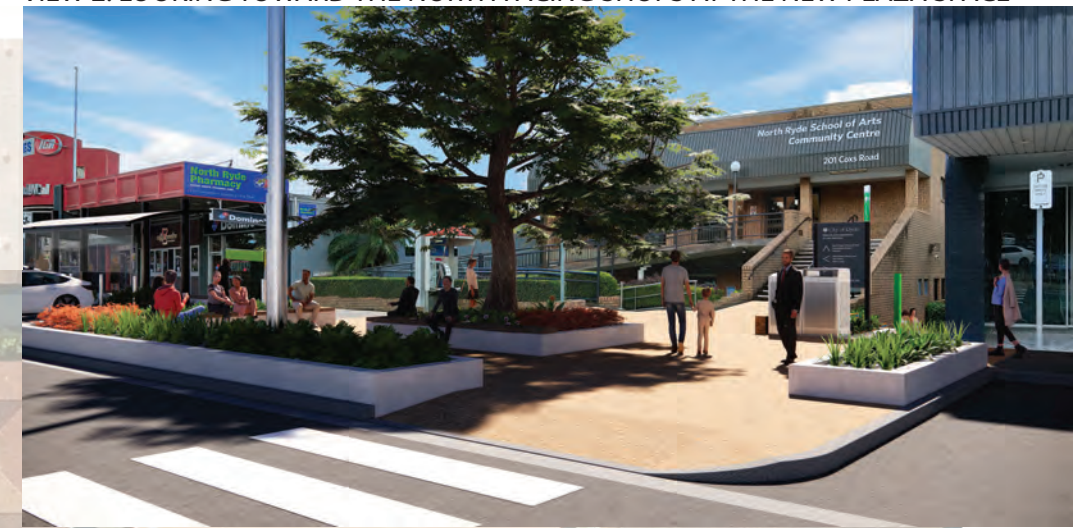
VIEW 2: LOOKING TOWARD THE NORTH FACING SHOPS AT THE NEW PLAZA SPACE

CONSTRUCTION COMMENCEMENT DATE: EARLY JUNE 2021 CONSTRUCTION COMPLETION DATE: FEBRUARY 2022