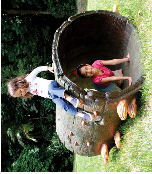
C HOLLOW LOG CLIMBER AND TUNNEL