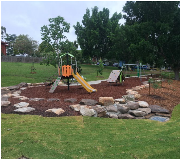
Above: Precedent Image