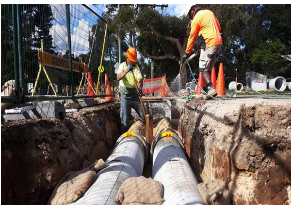
Example works in progress

Works will occur at the eastern side of the Higginbotham Rd/Cressy Rd roundabout and near No. 84 Higginbotham Road.