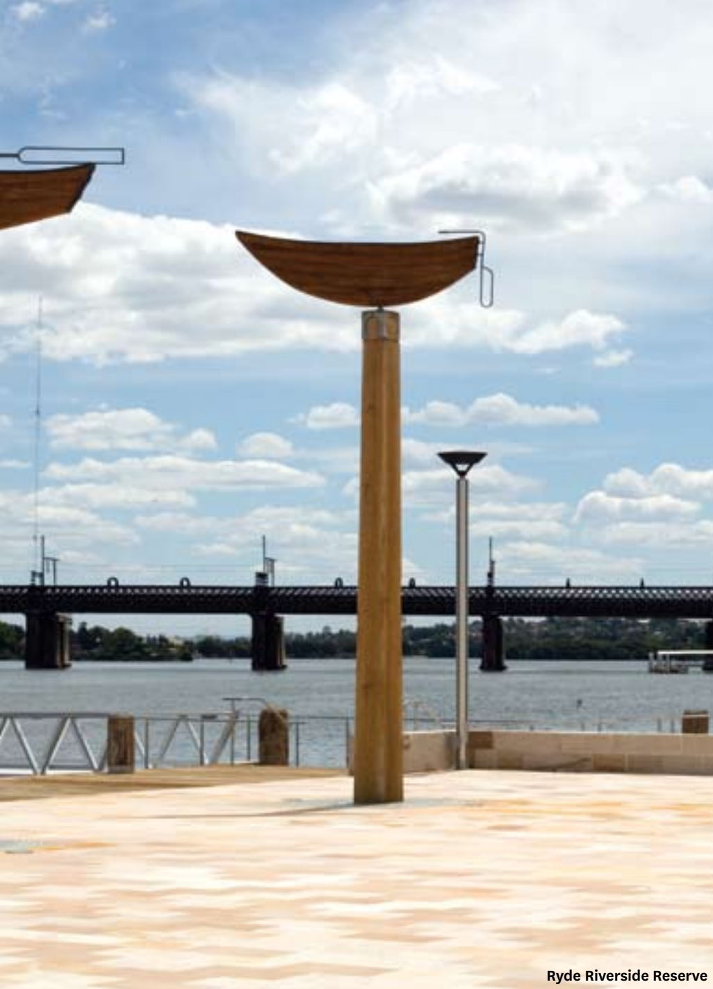
Ryde Riverside Reserve