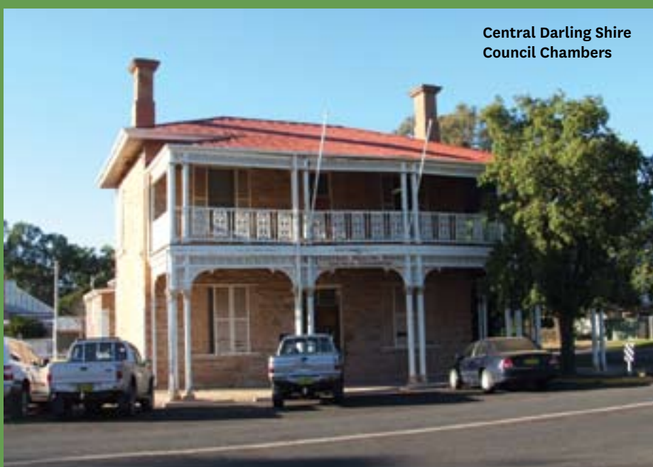
Central Darling Shire Council Chambers

Both Councils see a number of opportunities that will support and benefit both communities in working closely together. The partnership will seek to explore and develop opportunities that provide benefits for our respective communities in areas such as work experience, employment, education, economic development and community harmony.