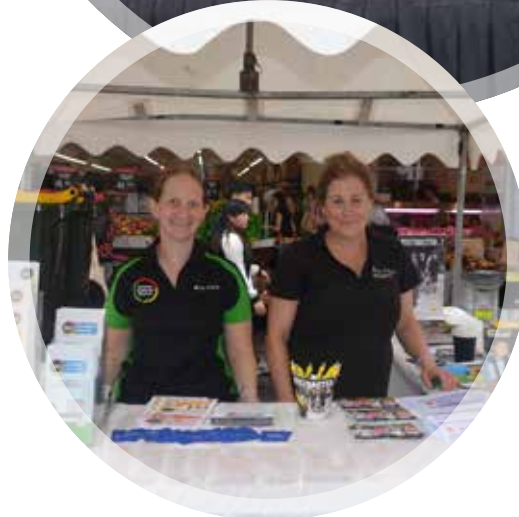
Community Information Expo