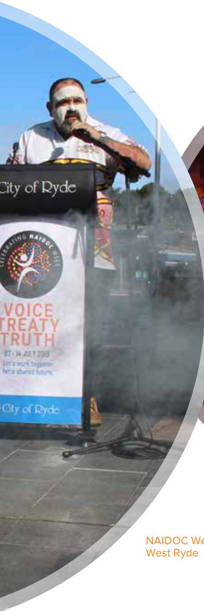
NAIDOC Week celebrations, West Ryde