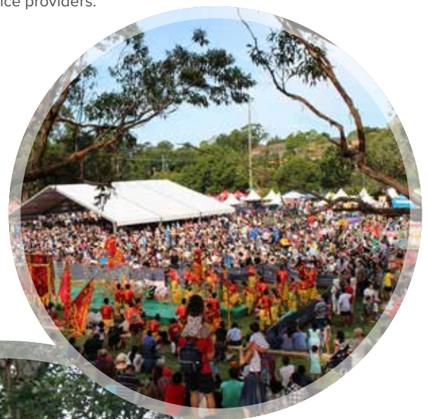
Lunar New Year

We celebrated the 2019 Eastwood Lunar New Year on 16 February, with festivities moving to Eastwood Oval for the 2019 celebration. A partnership between the City of Ryde and local Chinese and Korean communities organised the event. The event included kids carnival rides, market stalls and food trucks, kids shows, lion high pole, dragon dance, firecrackers, stage entertainment from cultural groups and a magnificent fireworks display ended the night. More than 20,000 celebrated the Year of the Pig.