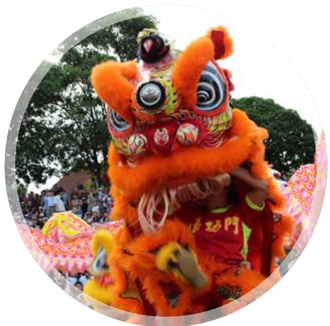
Lunar New Year