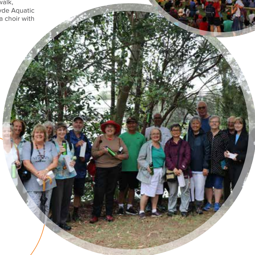
Seniors Week guided walk