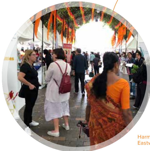
Harmony Day, Eastwood