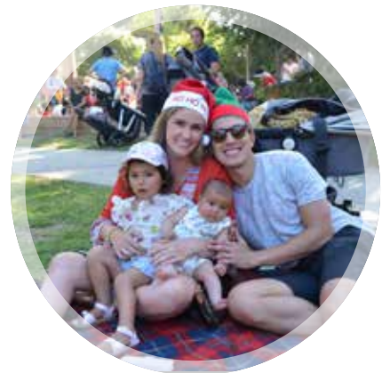
Community Christmas Celebration