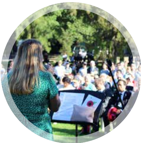
ANZAC Day in ANZAC Park, West Ryde

Supporting the Ryde Youth Theatre program and providing personal development and wellbeing outcomes for local young people.