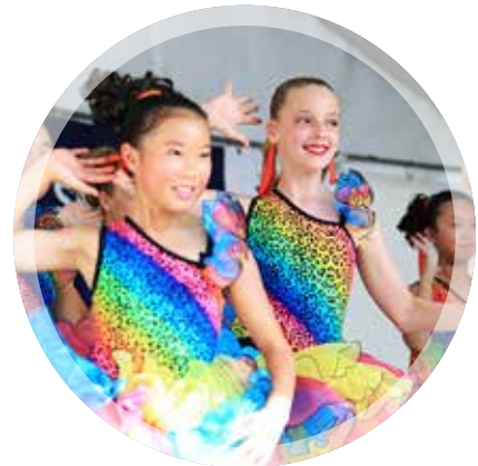
Granny Smith Festival