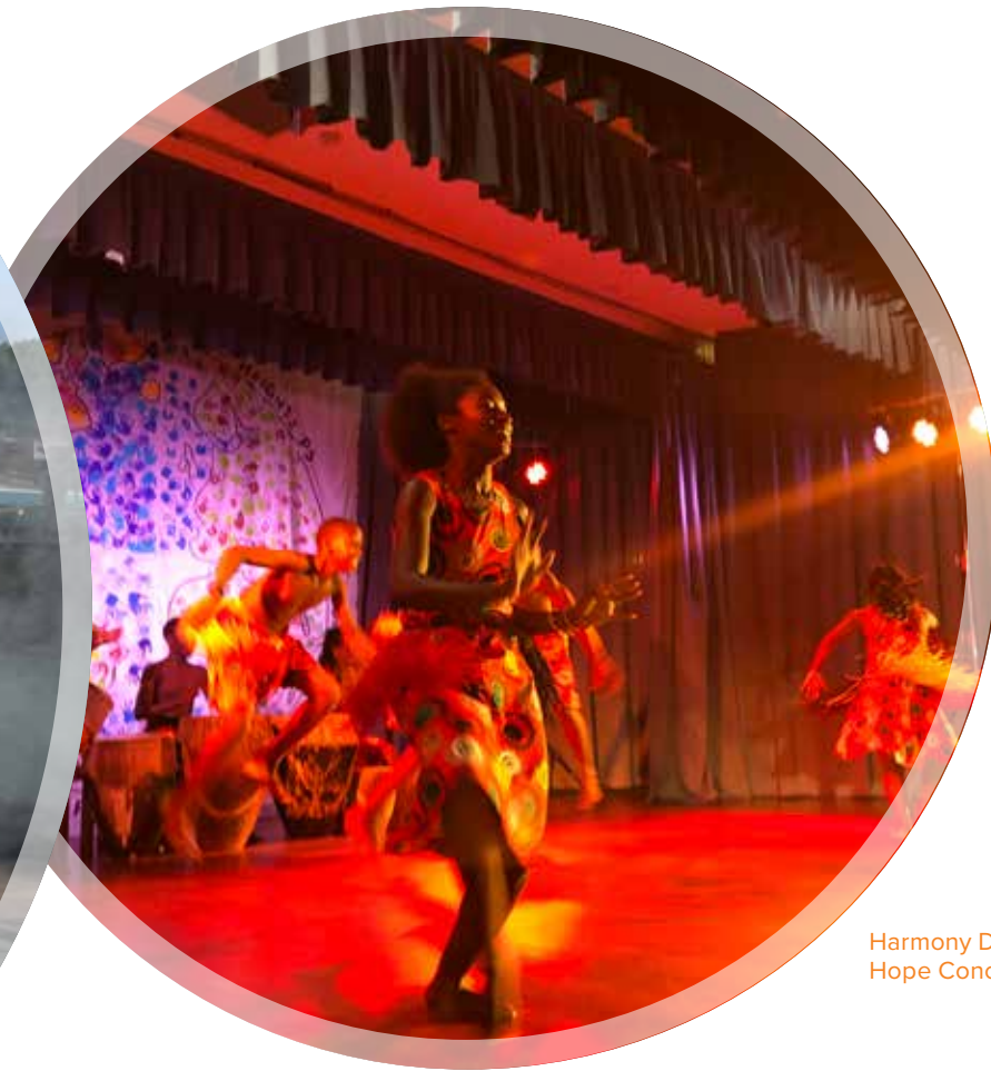
Harmony Day Hope Concert