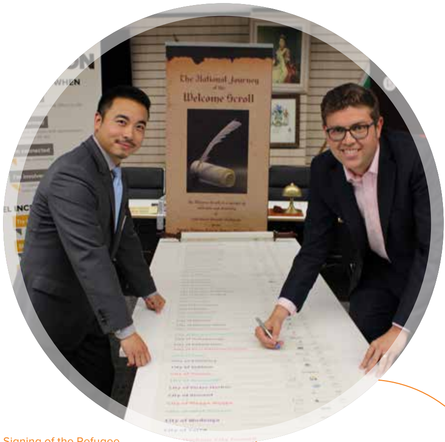
Signing of the Refugee Welcome Scroll

Led by the Ryde Youth Council, we celebrated the diversity and passion of our local young people through a series of Youth Week events in April 2019. These initiatives focused on empowering young people in the areas of mental health, education and employment and provided drug and alcohol-free recreational activities. The program was highly successful and was recognised with a highly commended award at the NSW Local Government Youth Week Awards.