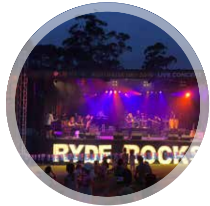
Australia Day celebration