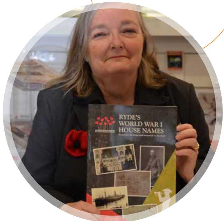
Book launch for Ryde's World War I House Names