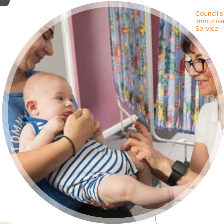
Council's Immunisation Service