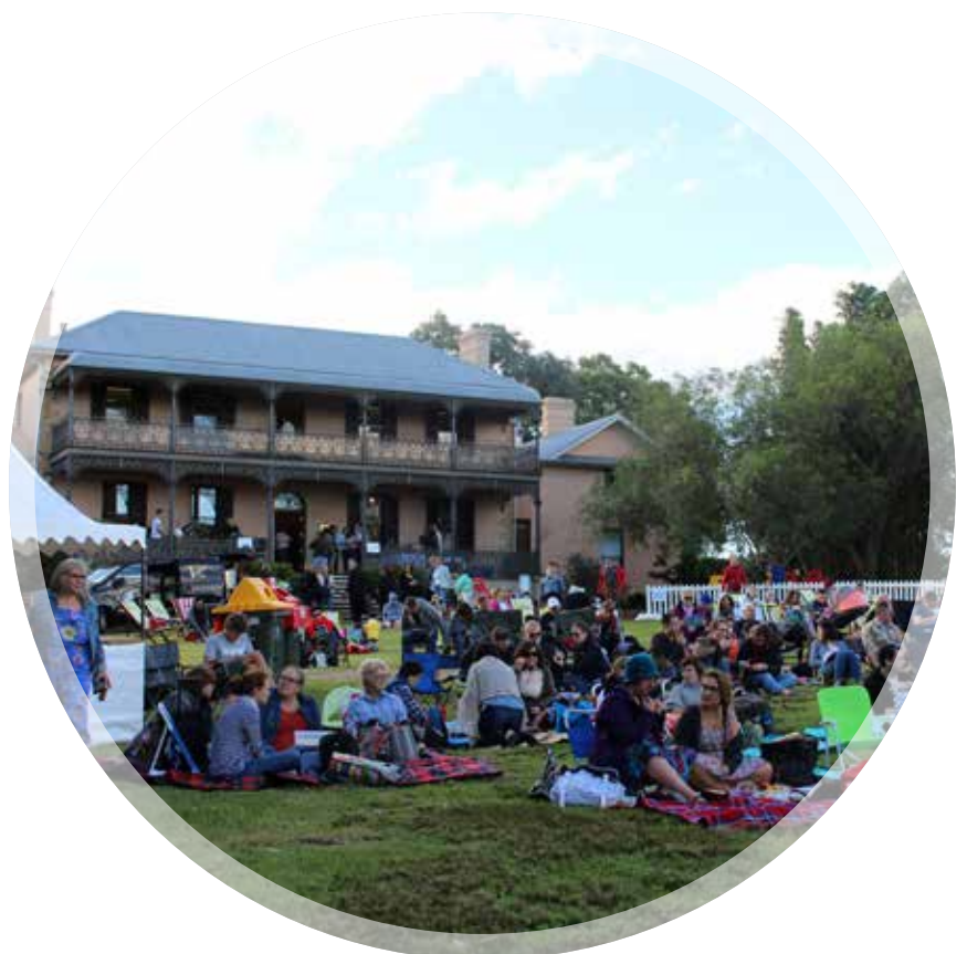
Orchestra in the Park at Brush Farm House

The event was well-received despite the cool weather and is set to return in 2020.