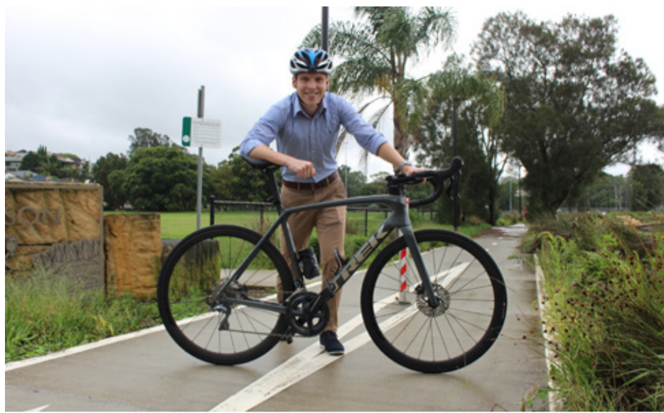
One of the highlights of the City of Ryde Sustainability Festival will be the Fix 'n Ride Workshops in which cyclists can receive a free bicycle check.