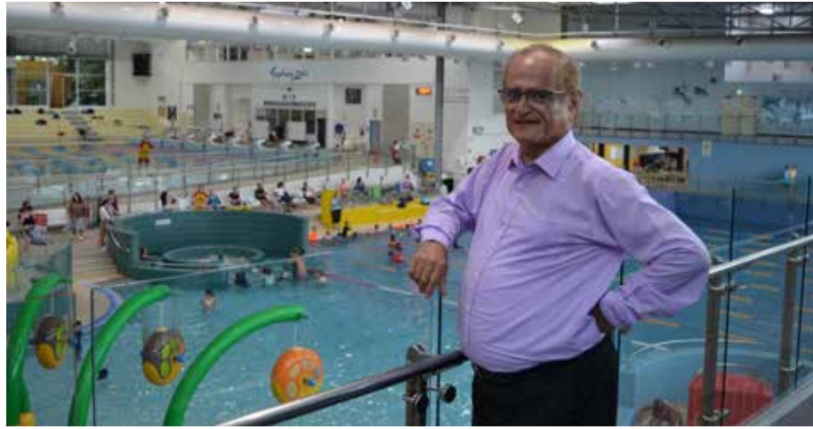
City of Ryde Mayor, Clr Sarkis Yedelian OAM at the Ryde Aquatic Leisure Centre