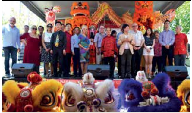
40 plus degree weather couldn't stop the Lunar New Year celebrations at Eastwood on Saturday