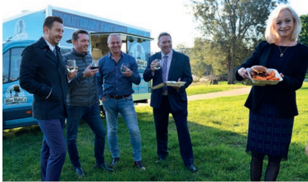
Enjoying food from Miss Mabel's Food Truck, in preparation for this Sunday's Cork & Fork event at Kissing Point Park, Putney.