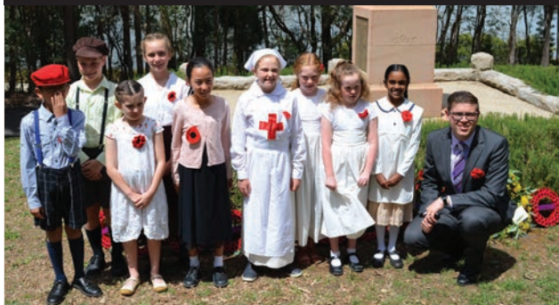
Students from Meadowbank Public School helped with the collection of a soil sample at the 2017 Remembrance Day Service.