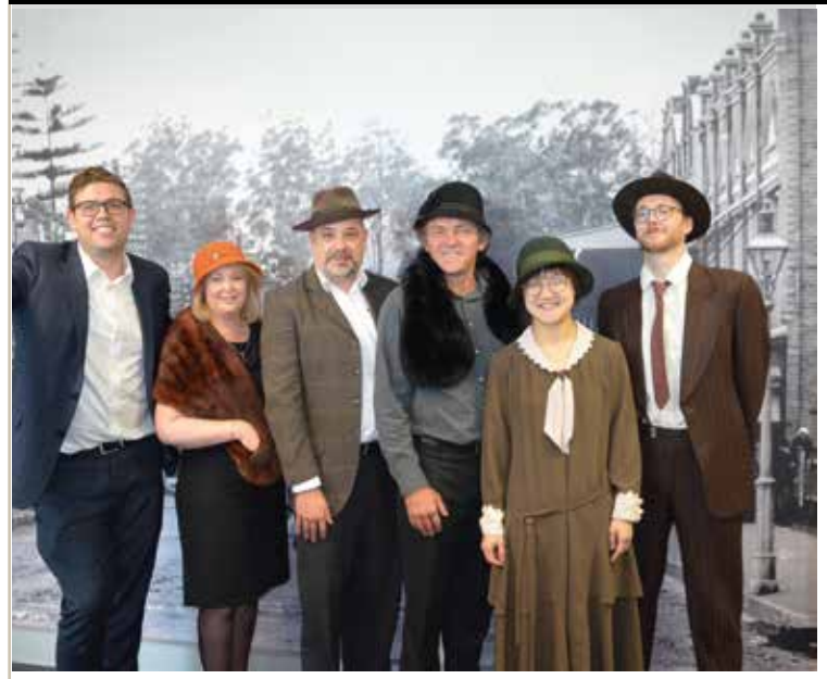
City of Ryde Library staff dressed in period costumes for the reopening of Eastwood Library last week.