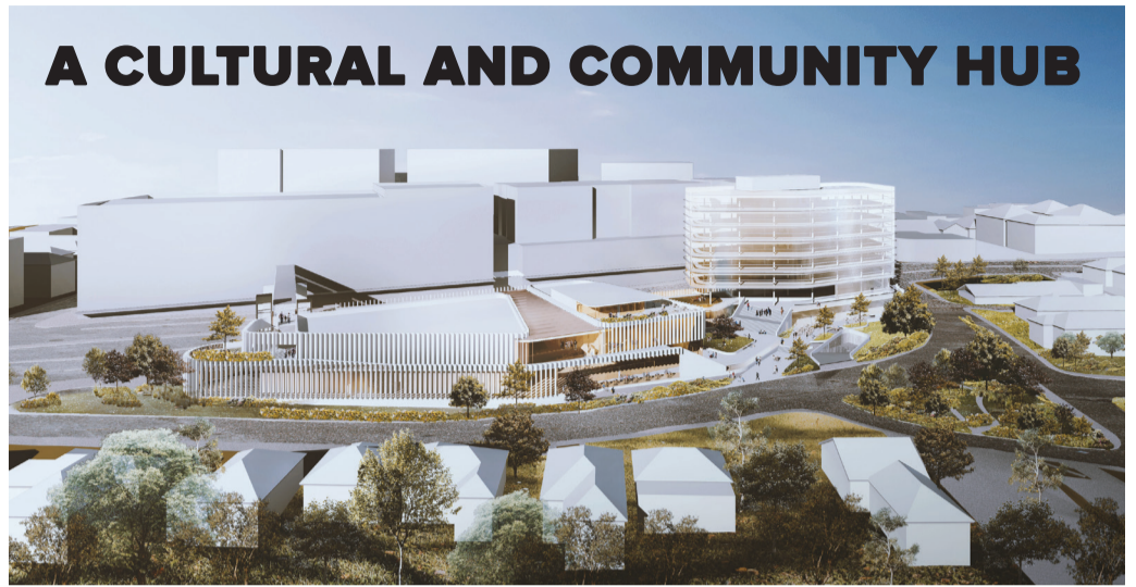
Please note these images are indicative of how the redeveloped Civic Centre site could look and are subject to change following community consultation.