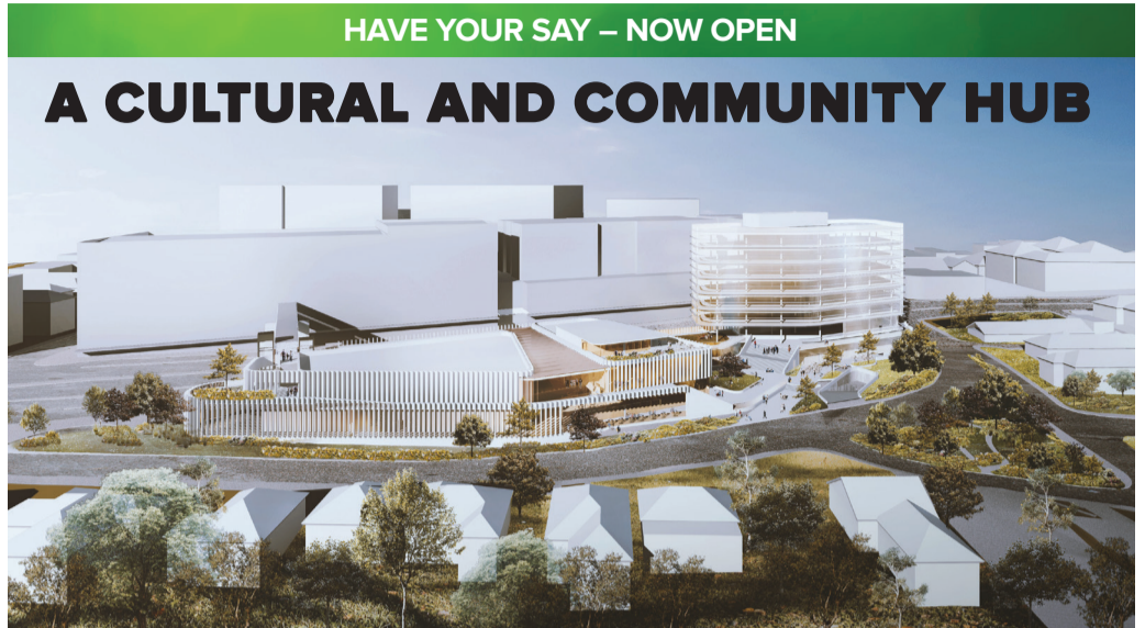
Please note this image is indicative of how the redeveloped Ryde Civic Centre site could look and is subject to change following community consultation.

THUR 18 JUL 10.00am – 2.00pm, Ryde Library Join us for a fun day of family festivities to celebrate Comic Con-Versation at Ryde Library. Dress up as your favourite superhero or comic character and join the celebration!