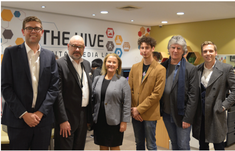
The official launch of The Hive Digital Media Lab at West Ryde Library.