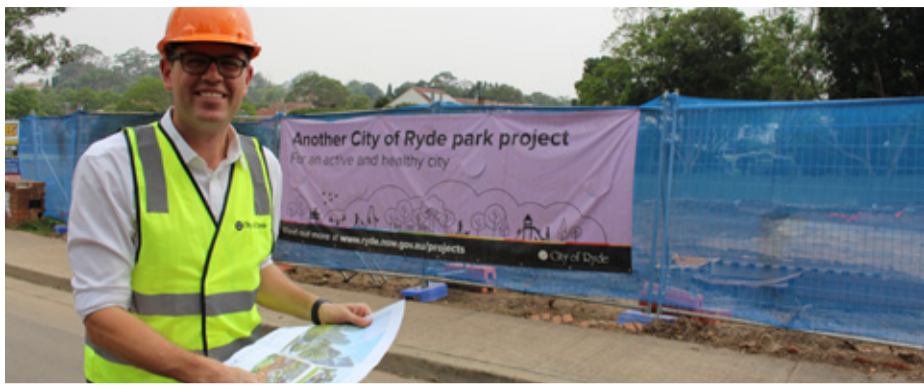
Investing in Ryde's recovery – A number of exciting projects are underway across the City of Ryde.