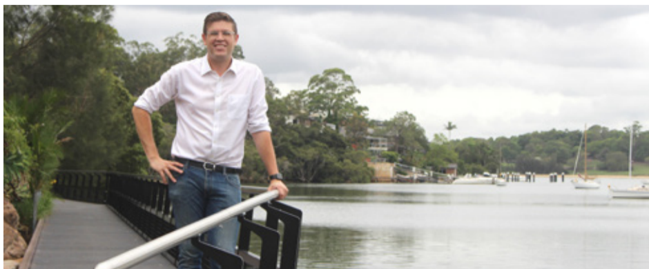
City of Ryde Mayor, Clr Jerome Laxale exploring the Ryde River Walk