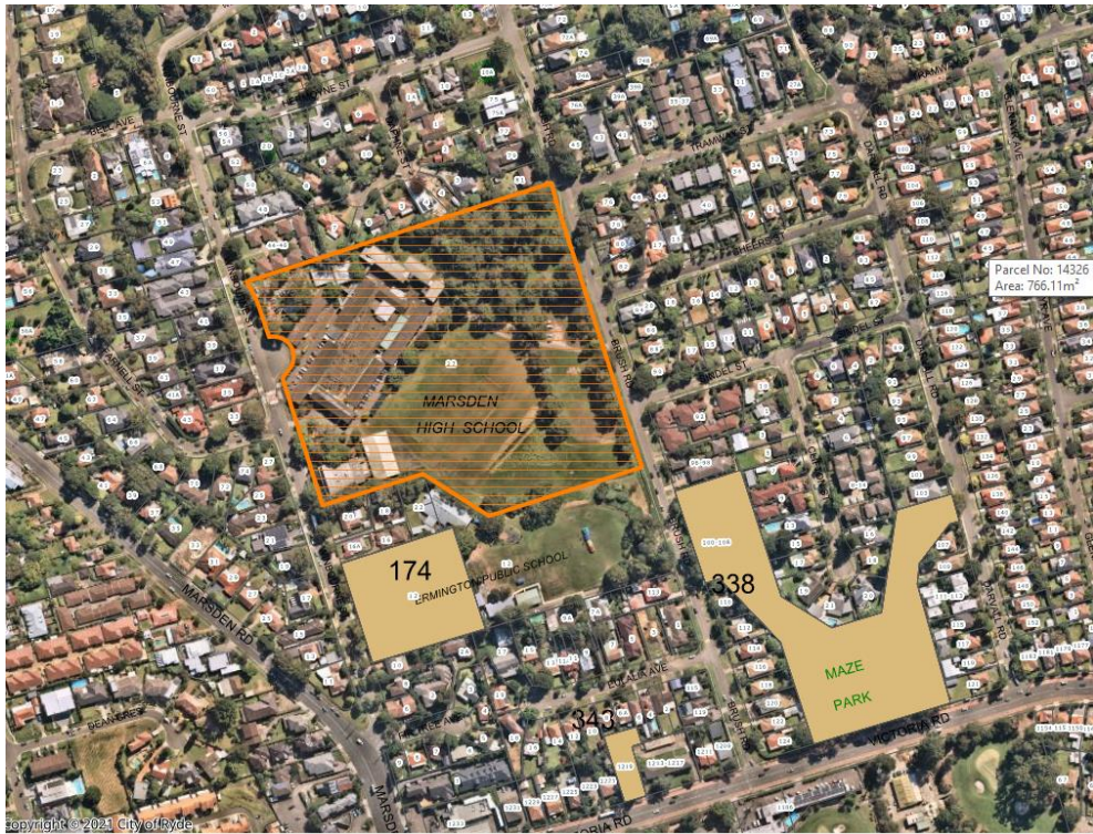
Figure 2: Aerial view of subject site and surrounds, including adjacent heritage items.