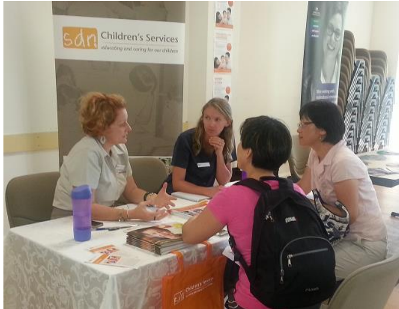
Above: Families receiving information from service providers