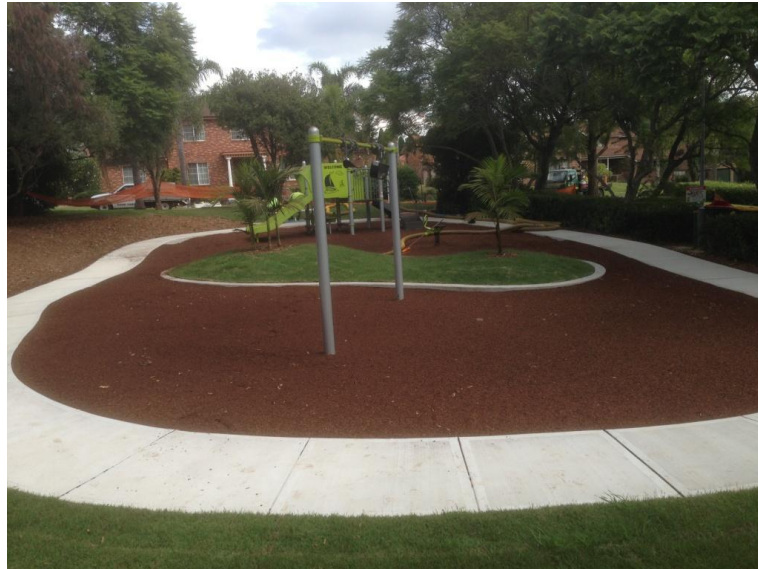
Above: Australia II Park playground upgrade completed in April 2013

Australia II Park was one of 14 parks across the City of Ryde to have playground equipment removed in February 2012. The draft Children's Play Implementation Plan identified this park as a suitable location for a local playground to be reinstated due to strong community feedback.