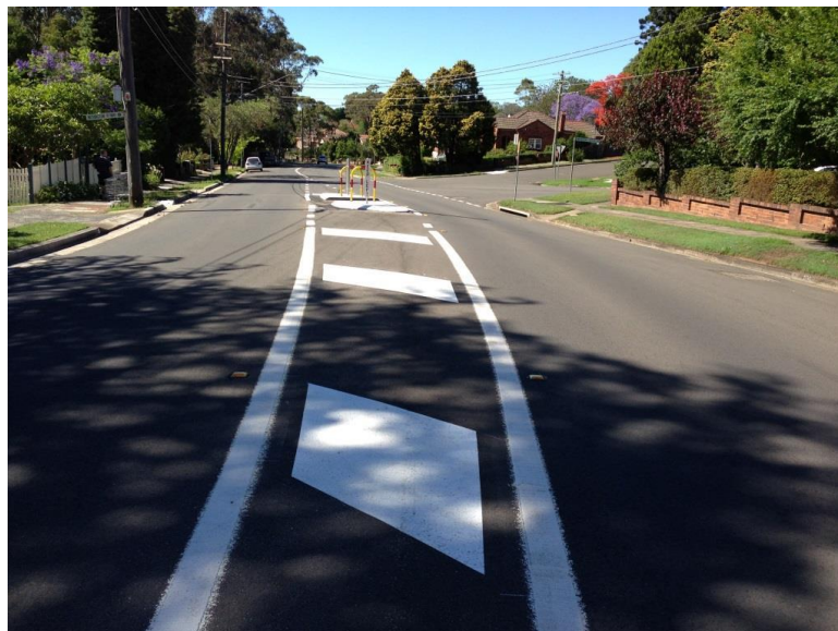
Above: Chatham Road, West Ryde, Traffic Island. Completed November 2012