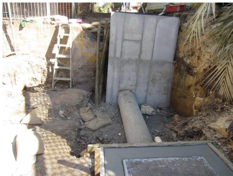
Above: Stormwater asset renewal at Gwendale Crescent, Eastwood. Completed July 2013