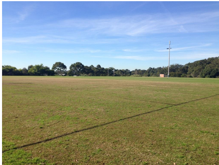
Above: Marsfield Park – grading, turfing, irrigation and synthetic cricket wicket. Completed December 2012