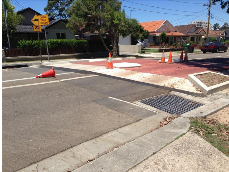
Above: Chatham Road, West Ryde, Flat Top Road Hump. Completed November 2012