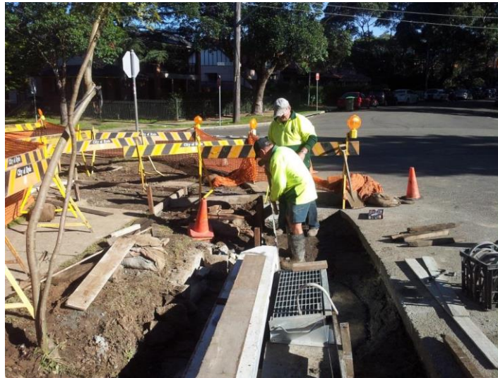
Above: Stormwater asset renewal at Miriam Road, West Ryde. Completed July 2013

The City of Ryde is committed to the effective management of its drainage assets. As part of this ongoing commitment, Miriam Road, West Ryde was included in the four year Delivery Plan 2012 – 2016 under the Stormwater Asset Replacement Renewal Schedule.