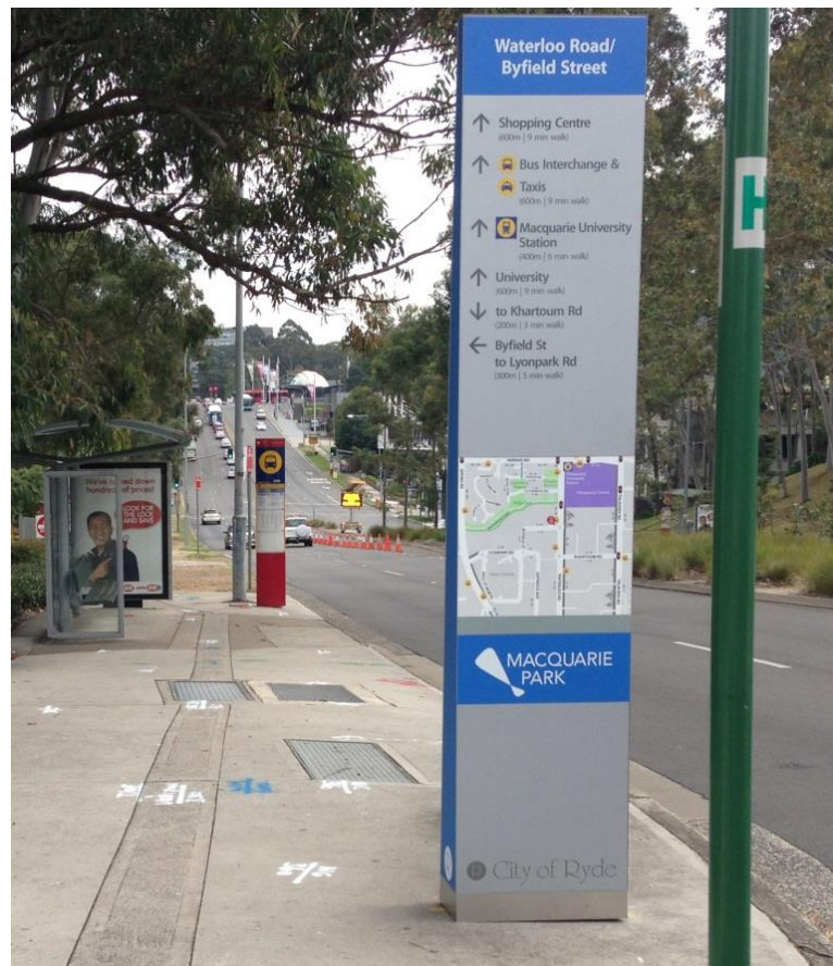
Above: Wayfinding Signage – Macquarie Park