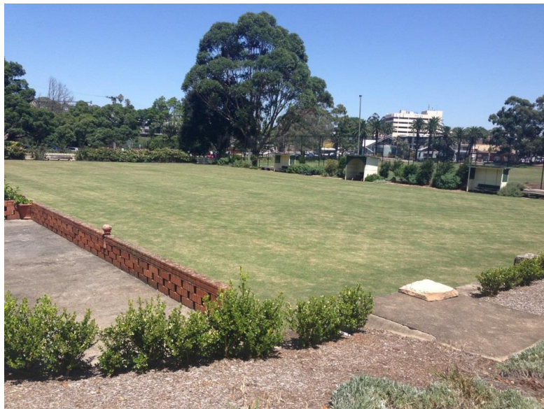
Above: Eastwood Croquet Club, renewal of croquet greens. Completed January 2013