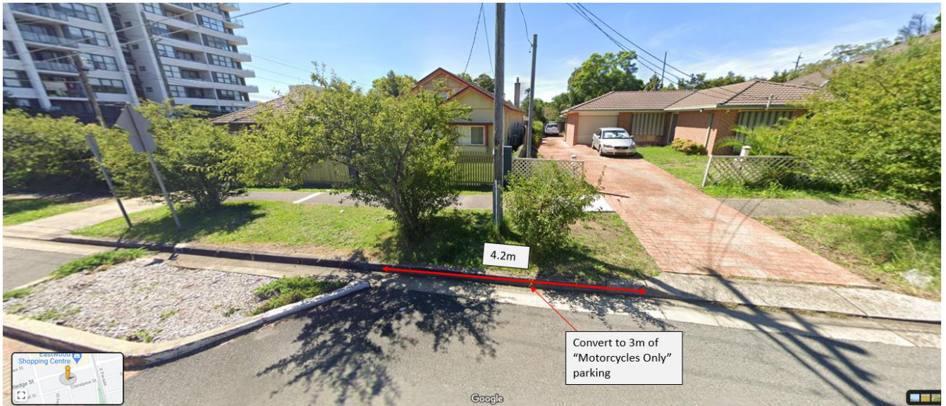
Figure 2: Proposed motorcycle only parking.