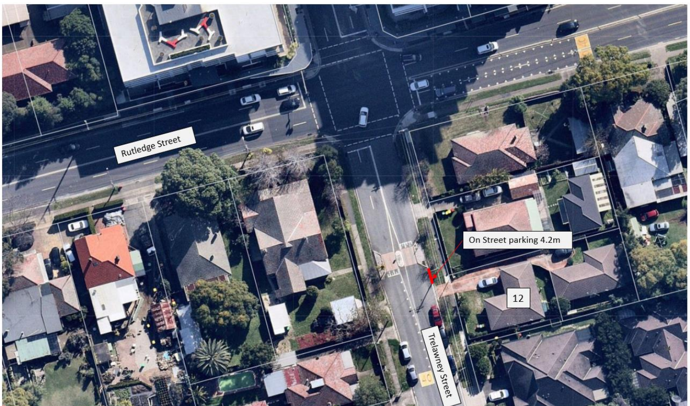
Figure 2: Locality map.

The on-street parking between the driveway and speed hump on Trelawney Street is approximately 4.2m long as shown in Figure 1. As per AS 2890.5 “On-street parking”, the minimum end length parking space is 5.4m.