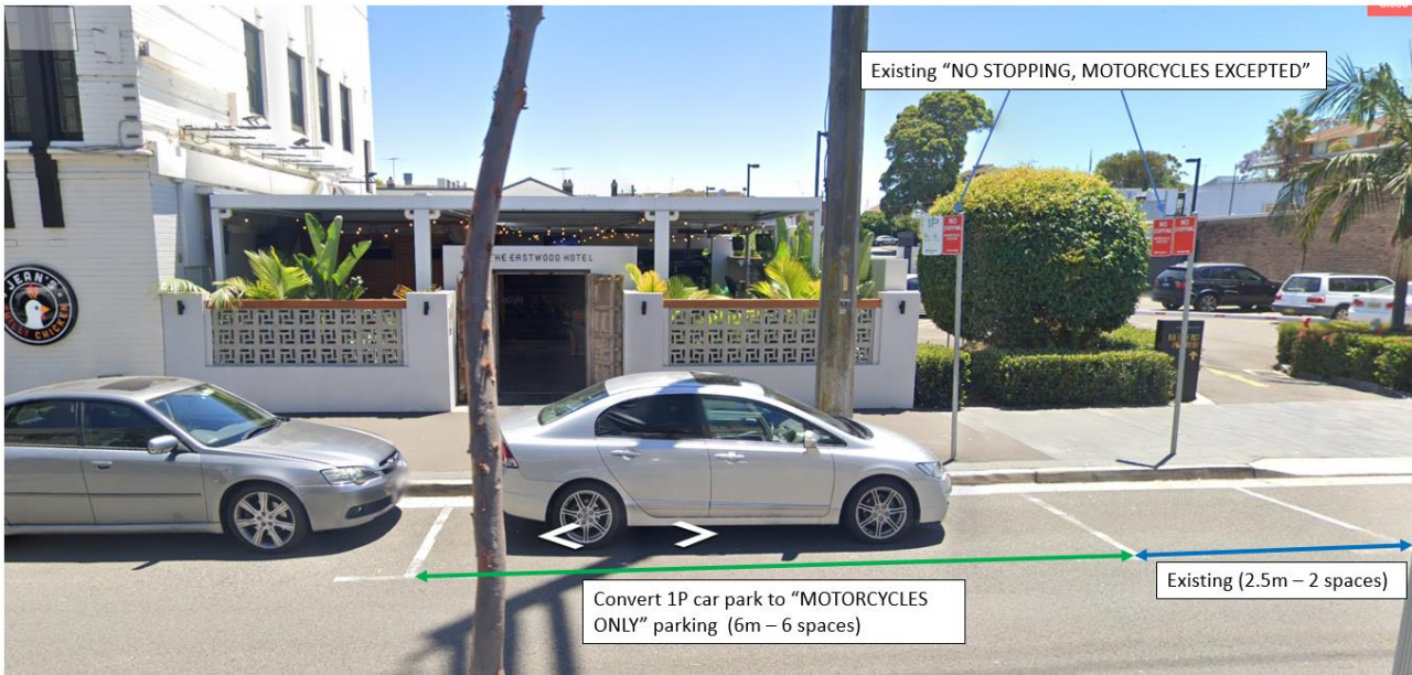
Figure 2: Rowe Street – Proposed additional motorcycle parking.