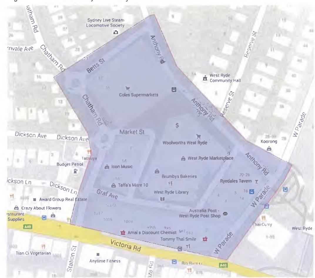
Figure 1.1 West Ryde Town Centre