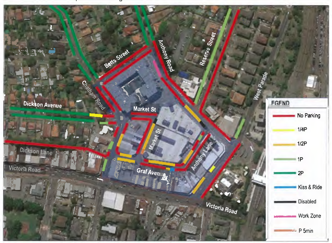
Figure 2.1 Existing Parking Facilities and Restrictions at West Ryde Town Centre

Most of the on-street parking spaces adjacent to West Ryde Town Centre are restricted to 1/2P or less, as detailed in Table 3.1. An overview of the available parking spaces in the vicinity of West Ryde Town Centre and their restrictions are presented in Figure 2.1.