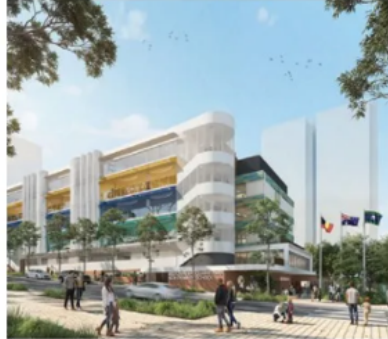
Artist impressions of the new school (images: NSW Govt)