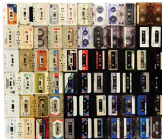
Route 66 Open by Dirk Kruithof

Entries are open until Sunday 23 July 2023.