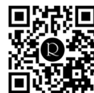
Translation Assistance 한국어 | 中文