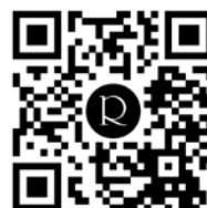
Scan to Have Your Say

Please visit our Have Your Say page at www.ryde.nsw.gov.au/HaveYourSay or scan the QR code below to see which topics are open for feedback. Be sure to check the Have Your Say page often to view any new consultations.